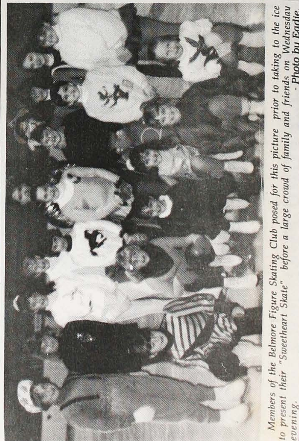
Members of the Belmore Figure Skating Club posed for this picture prior to taking to the ice to present their "Sweetheart Skate" before a large crowd of family and friends on Wednesday evening.