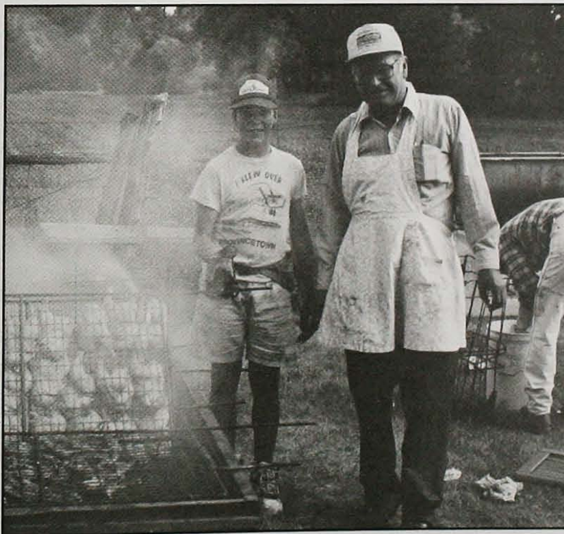
This past summer the Cathcart WI held a chicken barbecue. For the second year it proved a great success. They raised funds to cover the cost of renovations to the Hall.

The five WI Branches in Puslinch Township in Wellington South District worked together on a float for the parade in Aberfoyle to celebrate Canada's 125th birthday. Members of the Arkell Sym-phony Band led an old-time sing-a-long while a Puslinch WI member kept up a litany of recycling reminders. The five Branches - Arkell, Badenoch, Brock Road, Morrison and Puslinch - set up a booth for the afternoon and sold lemonade and cookies. The float took second prize for the best old-time costumes.