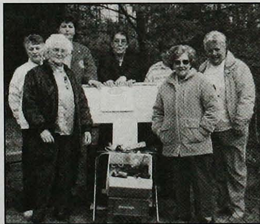
Members of the Markstay Women's Institute, Sudbury District, have been busy collecting used eye glasses. The glasses will be repaired and distributed in developing countries. The Branch also sews and donates diapers and other collected baby clothes to the Texas Birthing Centre.