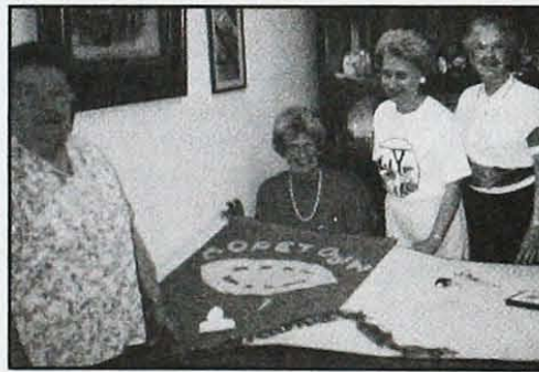
▲ Copetown Women's Institute members are busy working on a banner for their Branch to use at various upcoming functions. They also reported having sent 755 knitted squares to Zambia.

The November meeting of this Branch was open to the entire area in order to gather information for the third volume of "The Chisholm Story." The previous two volumes were on view and it is their hope to have the third volume together early in the new year. Members also held a gigantic yard and bake sale; all participants donated ten percent of their sales to the Branch.