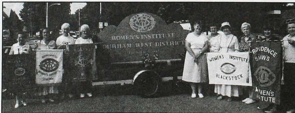
▲ Durham West District made this float for both the Blackstock and Orono Fall Fairs. Members are pictured (at left) holding banners representing the five Branches in the District.

This Branch served about 340 guests at a fund raising chicken barbecue held at their local community hall. The event raised money for upcoming centennial Branch activities and projects. This Branch happily reports the addition of a new member last September and the possibility of another.