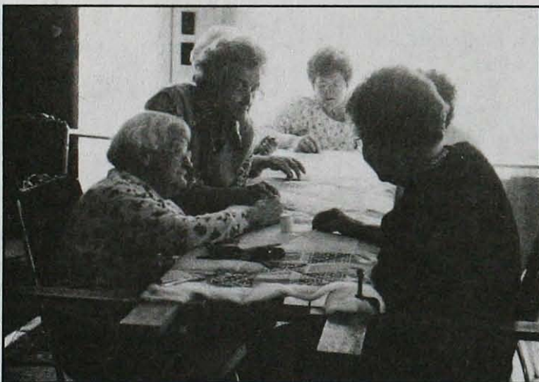
The Iron Bridge Women's Institute is pictured above making a quilt for a local family who lost their home to fire. They usually have one on hand to help those families in need.