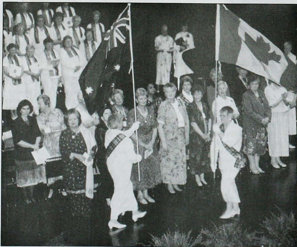
Below: Procession of the flags from the 68 member countries.

Volunteering enriches our lives. Without volunteers the world would, indeed, be a poorer place.