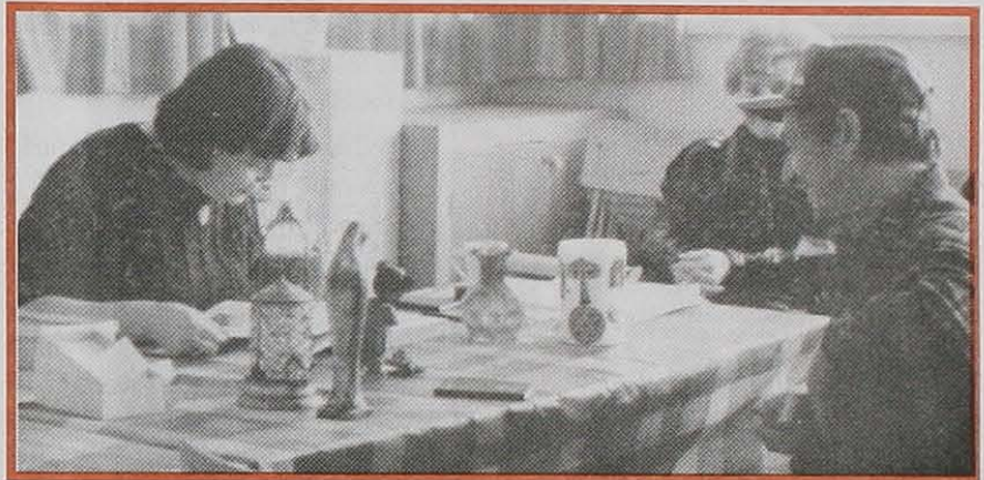
What's it worth? The appraiser goes over one gentleman's family treasures.