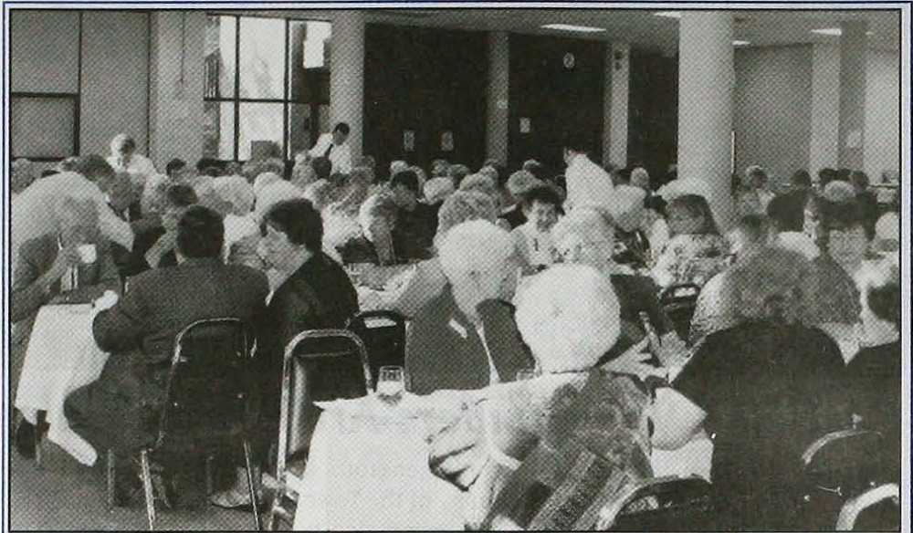
Women's Institute members and guests are shown enjoying a meal together at the 2004 FWIO Conference.