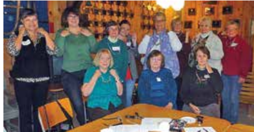
Pictured: A past workshop at the Lee where crocheted wire necklaces were made!

Visit the FWIO website or contact your Regional Board Director for more information.