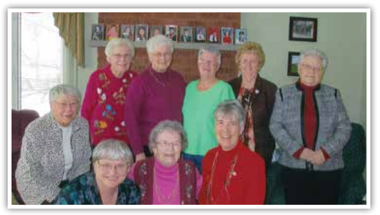
Pictured: Members of Queen's Line WI.