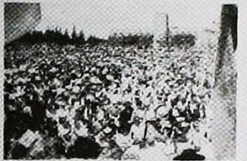
CROWD OF 12,000 VISITORS GATHERED AT GUELPH FOR THE 50TH ANNIVERSARY CELEBRATION.

Great Gathering of 12,000 Institute Members Assembled at Guelph, Pay Tribute to Pioneers of 1897