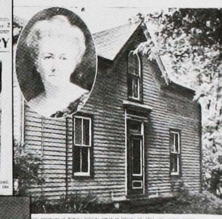
Photograph of a woman's home, showing the exterior of the house.