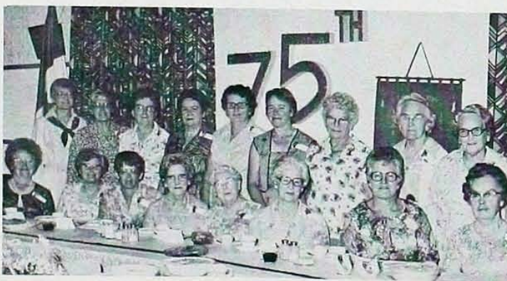
BEACHBURG W I, RENFREW NORTH DISTRICT , has the distinction of being the oldest Branch in the District and are responsible for Grandmother's Day as an Institute custom throughout the country. Above are present-day members celebrating the occasion of the 75th anniversary of the Branch.