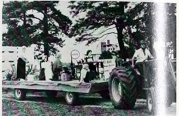
Judged the best! GREELY MANOTICK, CARLETON EAST DISTRICT float won in the parade competition at the Manotick Station Reunion.