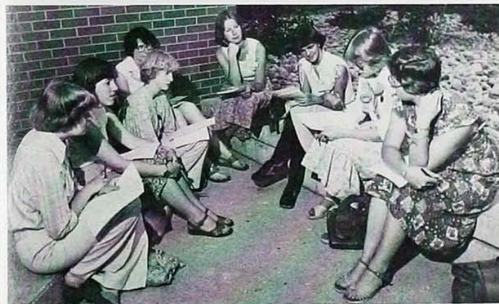
Delegates ponder a question.