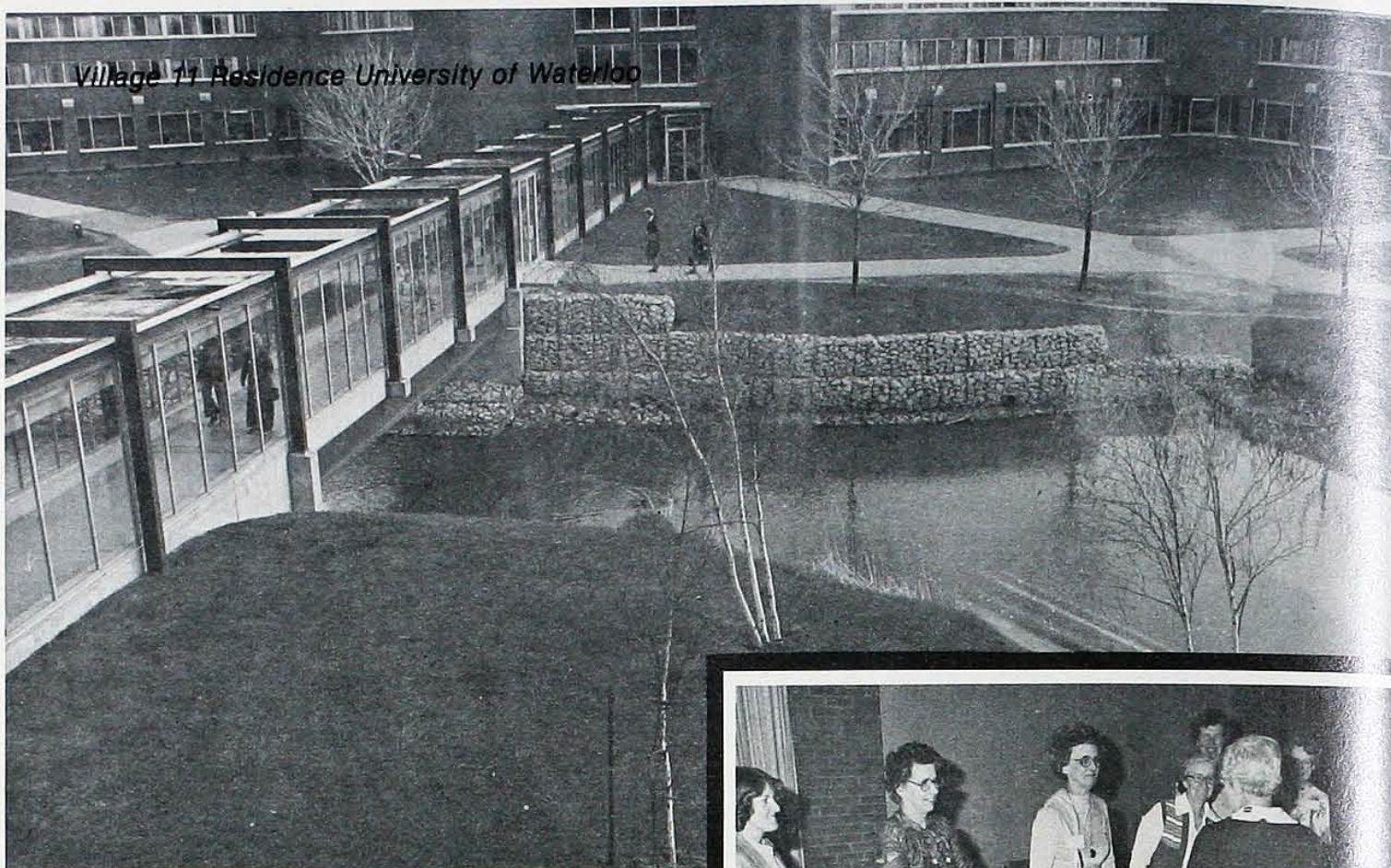
Village 11 Residence University of Waterloo