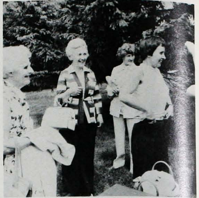
York East District members visit the Erland Lee Home during WI week.