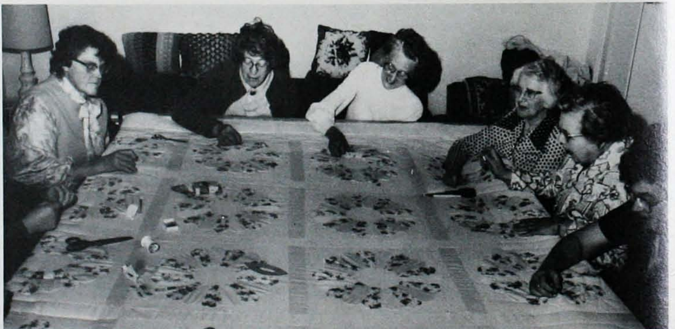
Ravenna W.I. members, Grey East District, work on a quilt to be sold at their craft fair.