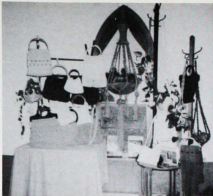
Twenty-five ladies participated in the Windfall WI Macrame course taught by two members.