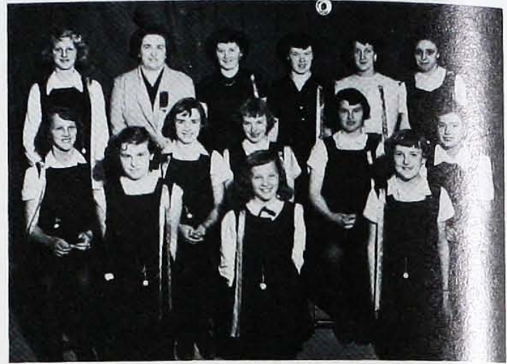
Pine Ridge WI, remember their 4H days.