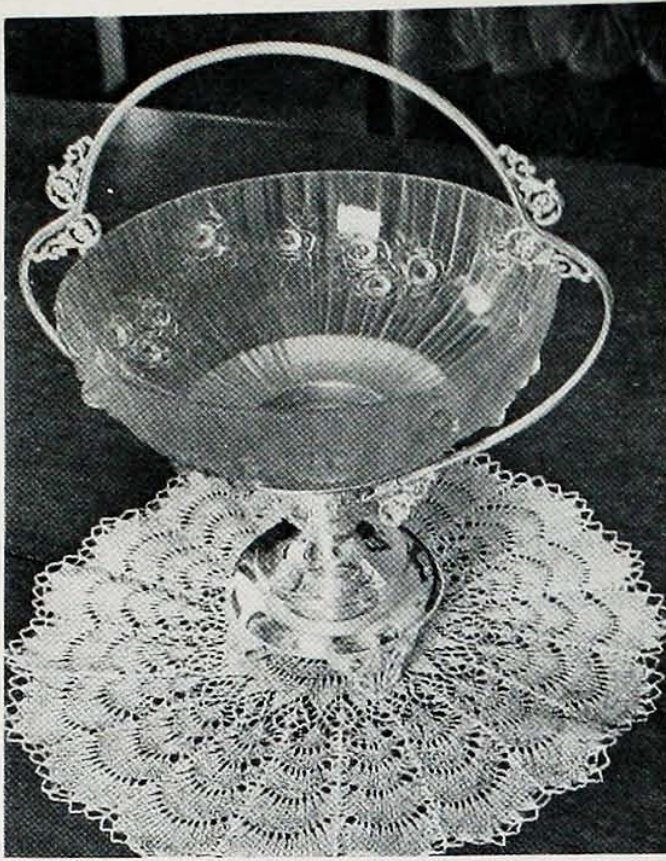
Bride's Basket donated by Haysville Women's Institute, will be seen on the dining room table.

We have interesting plans for the Drive House. It will become an interest and craft centre. A new stairway to the loft is being built and we will have some displays upstairs.