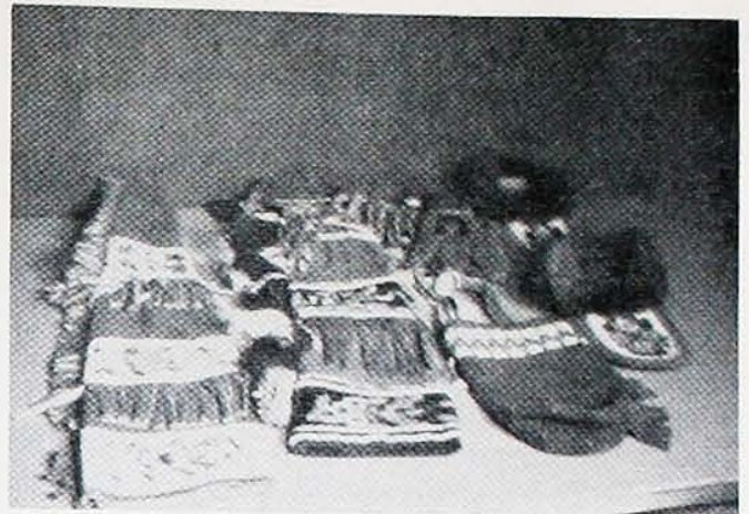
Hand embroidered and beaded gun cases from Fort Simpson and Fort Norman.

As I took off for Fort Smith on July 5th, the convention date had not been settled other than probably the middle of August. Time was precious and there were innumerable and seemingly unanswerable questions. There was not a Territorial Convention Committee, so I would be working with the Institutes scattered