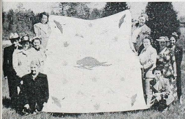
The second prize Manitoulin West quilt features the maple leaf, the beaver and the Canada goose.

We may not be able to leave our family much of this world's goods, but we sincerely pray that this rural home may mean the opportunity to learn good work habits, sound moral character and a chance to pursue school