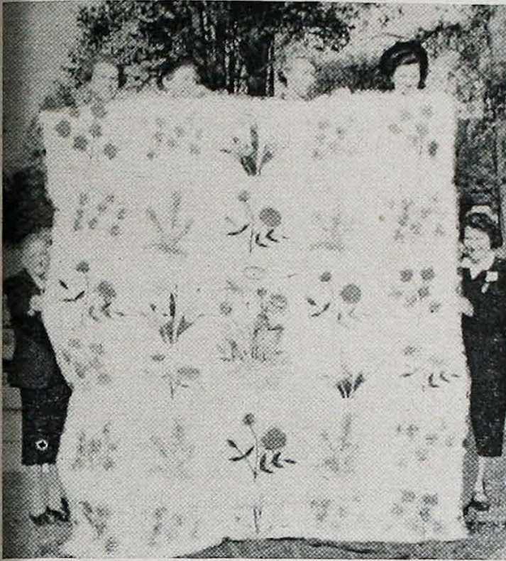
The first prize Manitoulin East quilt, Sheguiandah Institute, features the thistle, shamrock, rose, maple leaf and the Manitoulin orchid.

We, in the rural homes of Canada, are so fortunate. Through our open windows wafts the smell of new-mown hay not tainted by factory smoke and automobile exhaust. Around us at night is the soft, clean air, free from the jangle and clatter of traffic. Within our picket fences children play safely with their pets for companions. Our roots are sunk deep in the good earth, planted with the golden wheat and green grass.