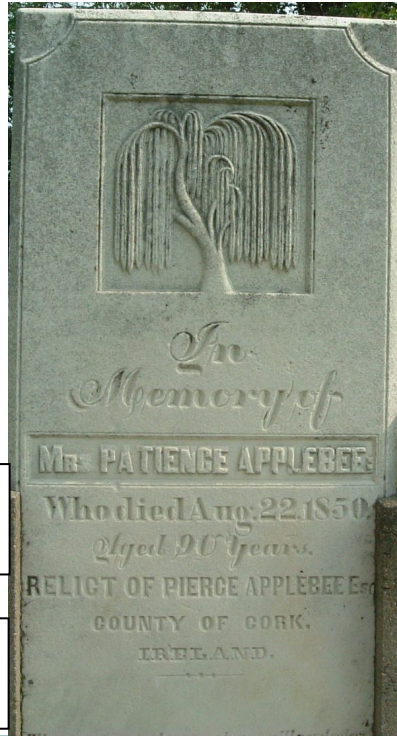
EHS15150 Patience Applebee