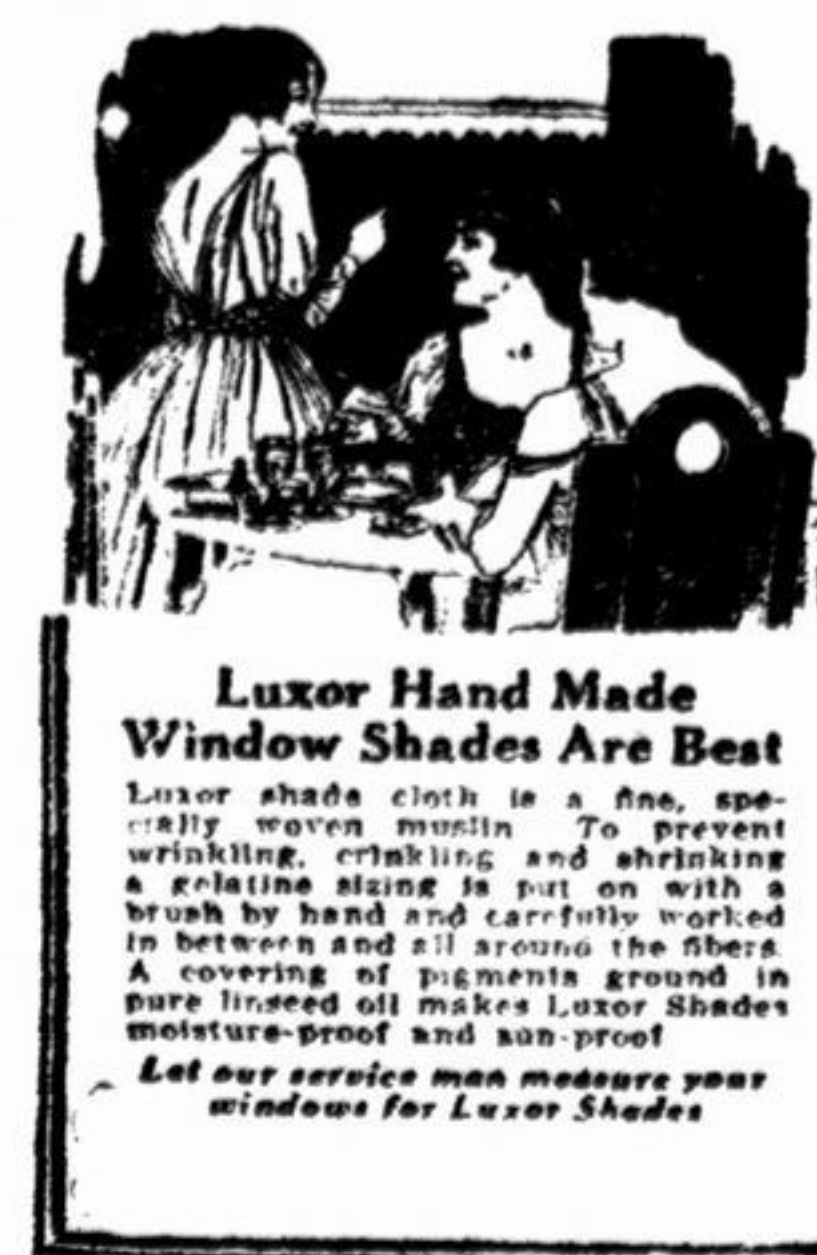
Luxor Hand Made Window Shades Are Best

Men's all cloth, cool summer "Napoleon" style suspenders. Will last a lifetime, special for only 79c