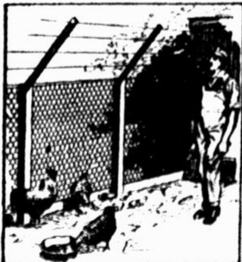
Wires Stretched as Shown Here Will Effectively Prevent Chickens From Wandering Into the Neighboring Yard.

Chickens can be kept in their pen by nailing two-foot slats at an angle to the posts and stringing a number of strands of thin wire through them as shown in the drawing. The chickens do not see these wires and when