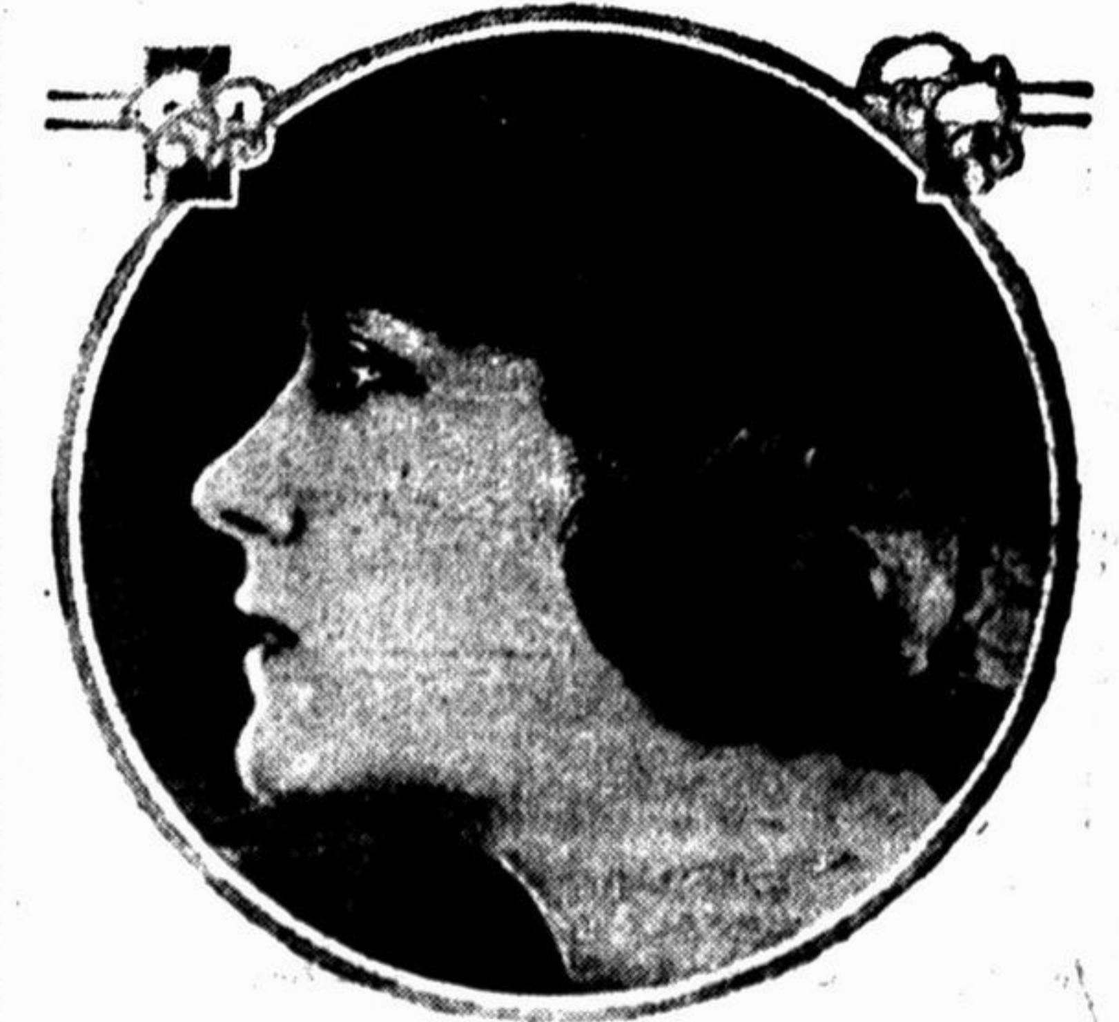
Gloria Swanson in the Paramount Picture "THE GREAT MOMENT"

Tuesday and Wednesday, November 22d and 23d Gloria Swanson IN ELINOR GLYN'S The Great Moment WITH MILTON SILLS A Paramount Picture