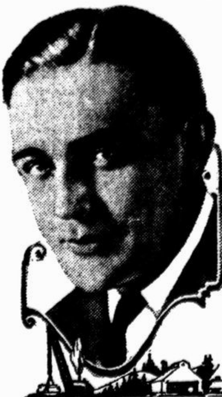
Wallace Reid in the Paramount Picture "The Hell Diggers"

The thrilling adventures of Bill and Bob, more exciting than "Outwitting the Timberwolf," which you saw at the High School show last week.