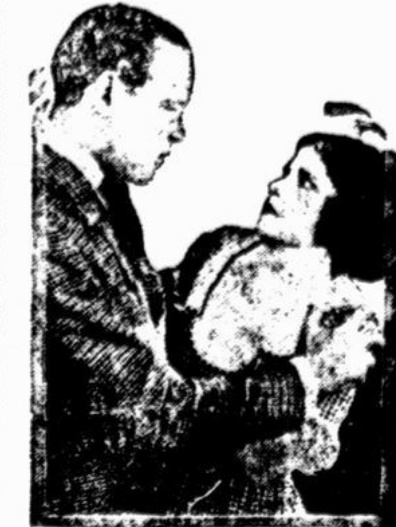
VIOLA DANA "THE CHORUS GIRL'S ROMANCE"

The critics proclaimed this the finest comedy drama of the year. It certainly is a picture you should not miss as it is far above the average entertainment value.