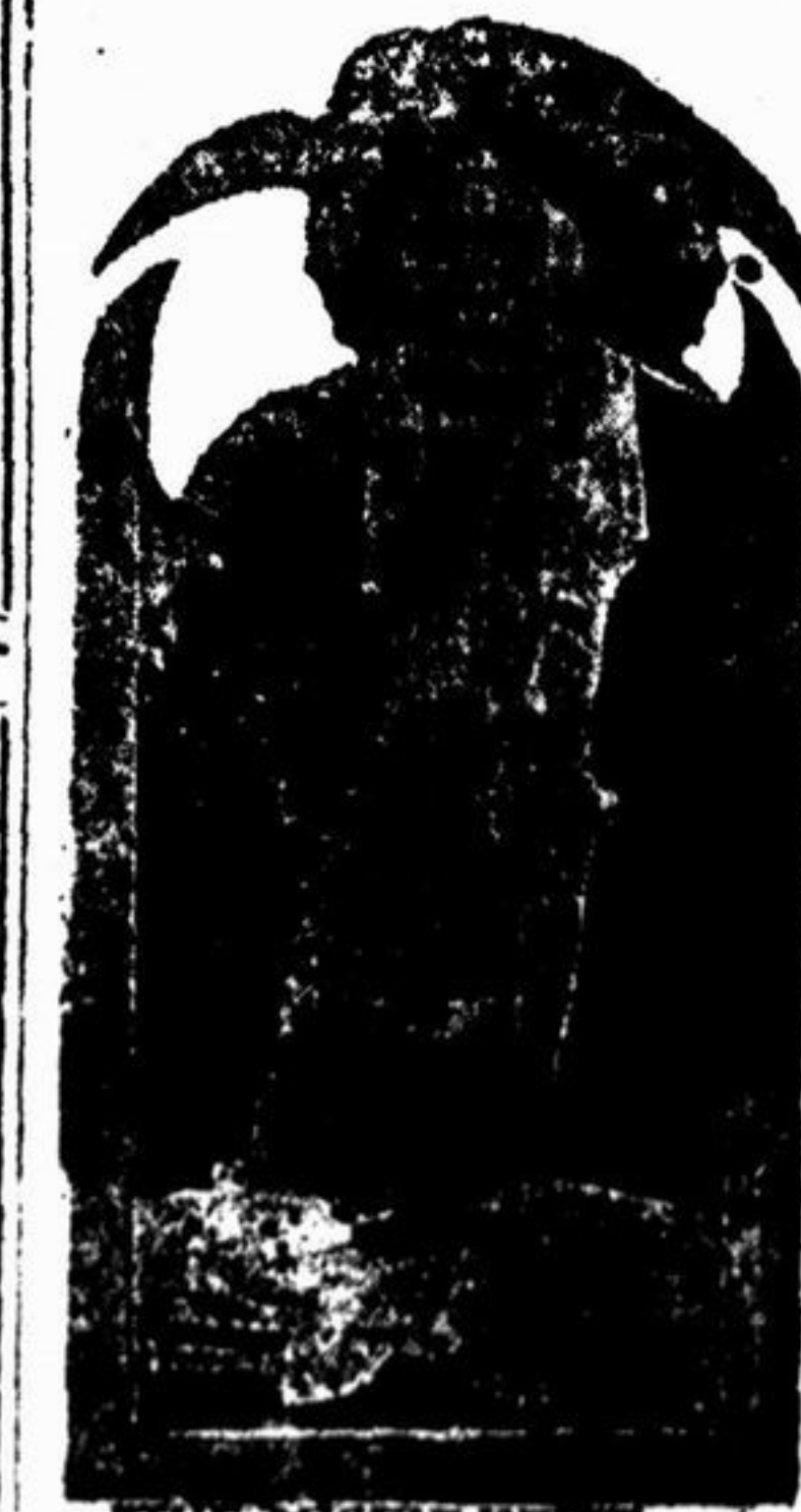
THE MISFIT WIFE ALICE LAKE

A humorous and unusually appealing story of a little manicurist who married out of her station in life when she accepted the offer of a rich young man to become his wife. This is without doubt Alice Lake's finest picture since "Shore Acres."