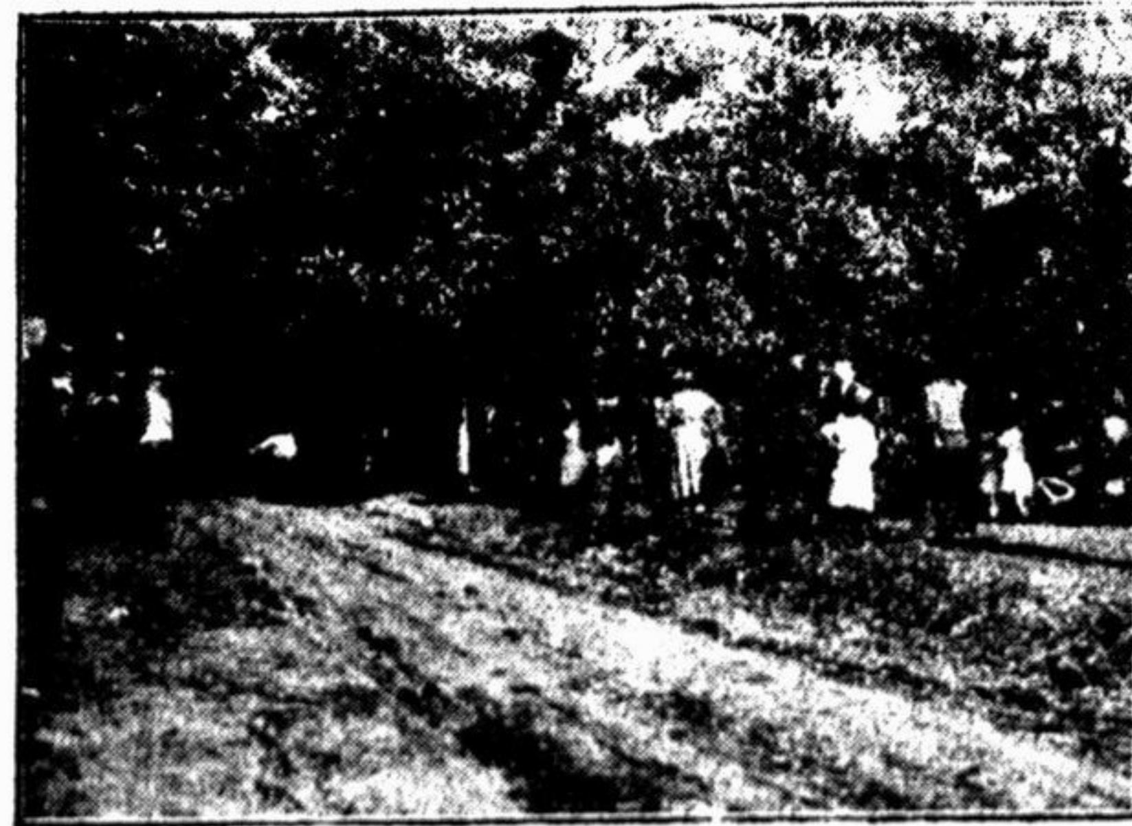
ENTRANCE TO THE FAIR GROUNDS