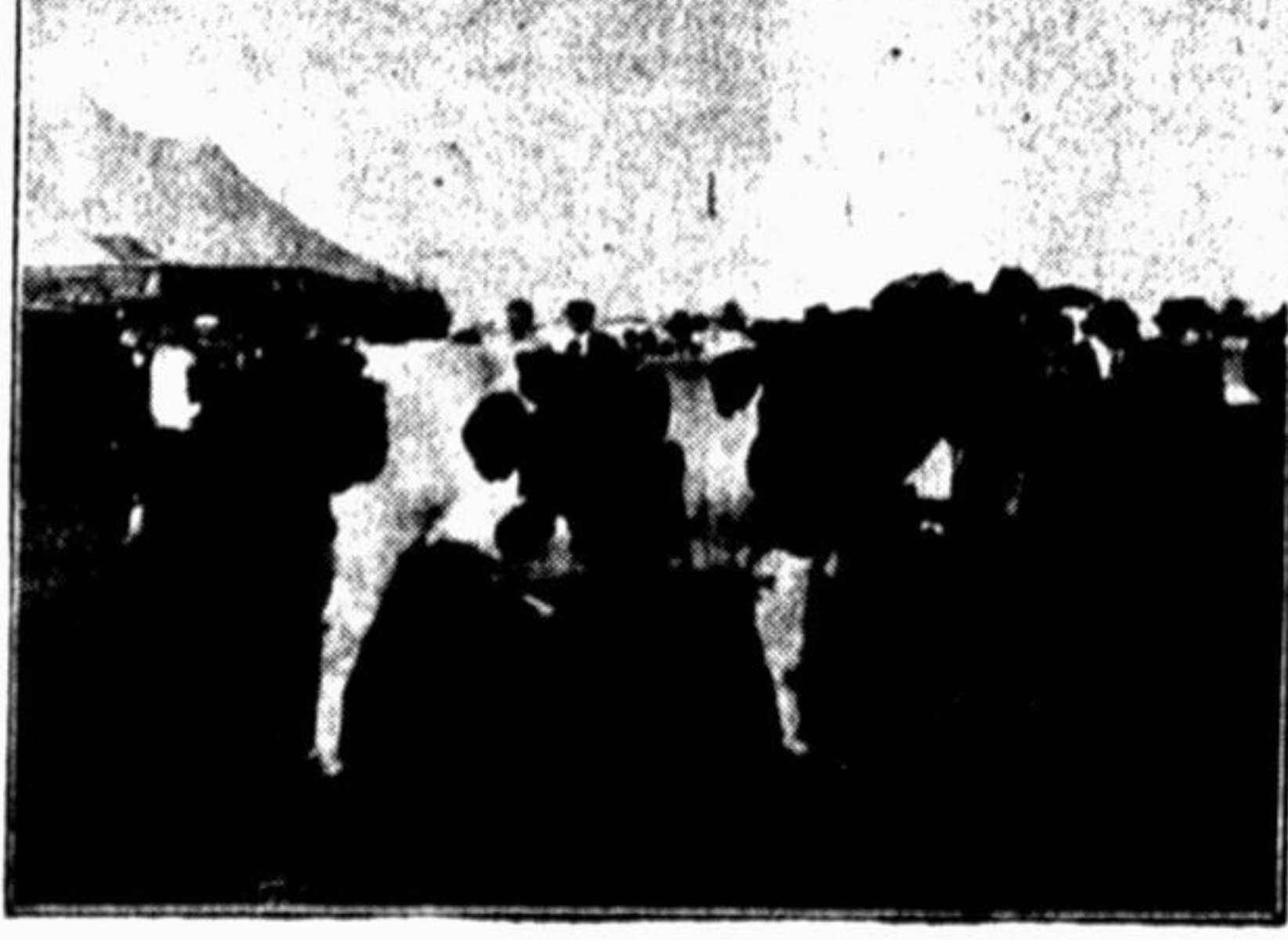
THE BEST MALE AT THE FAIR Hlini Homestead Hartog No. 29132 Lisle Farms Co. prize winning Holstein bull, over 1 year and under 2.