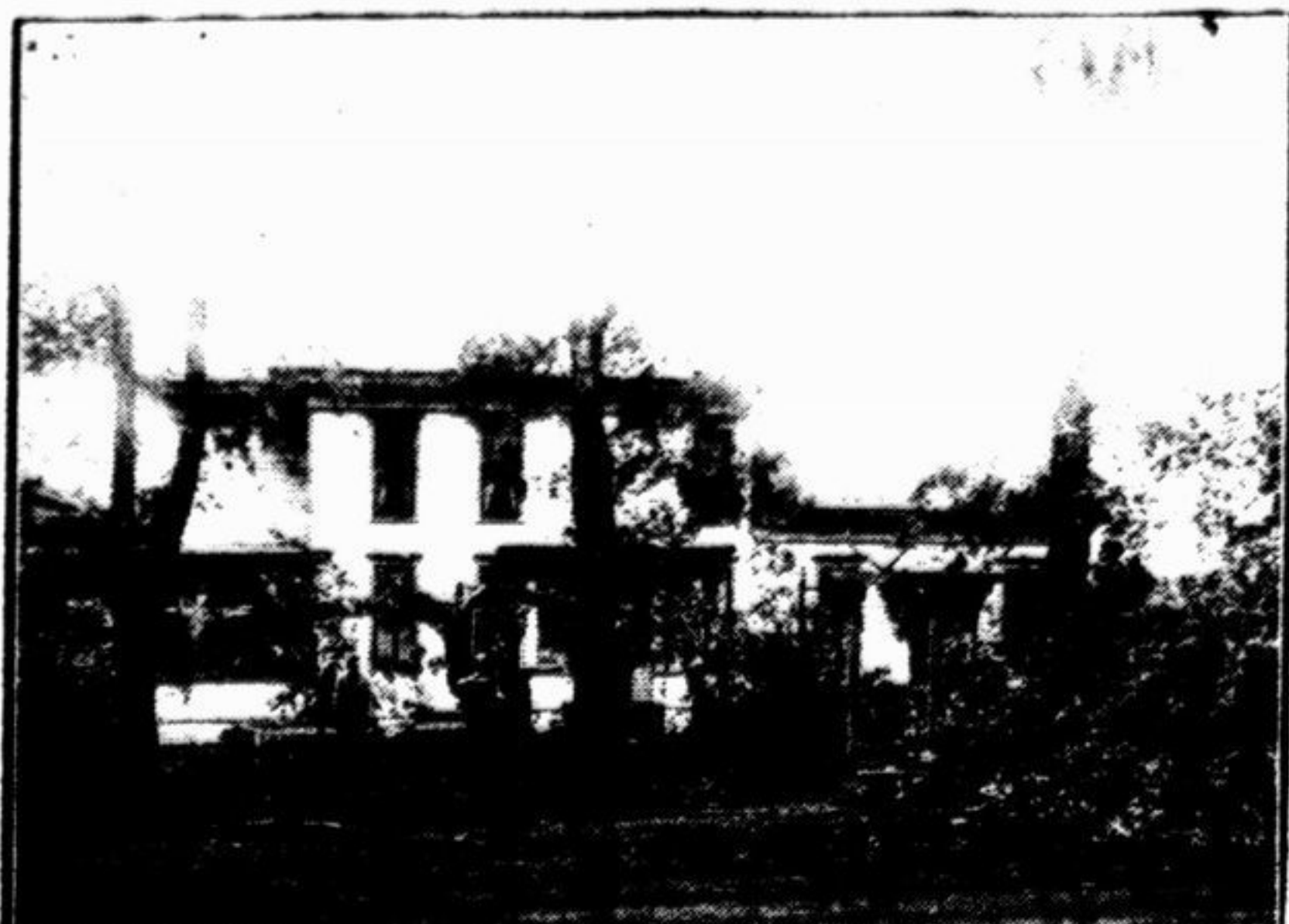
Showing the twisting effect of the wind. The tree in the center was split in two; one half falling in each direction. This is the east side of the Shaffer home.