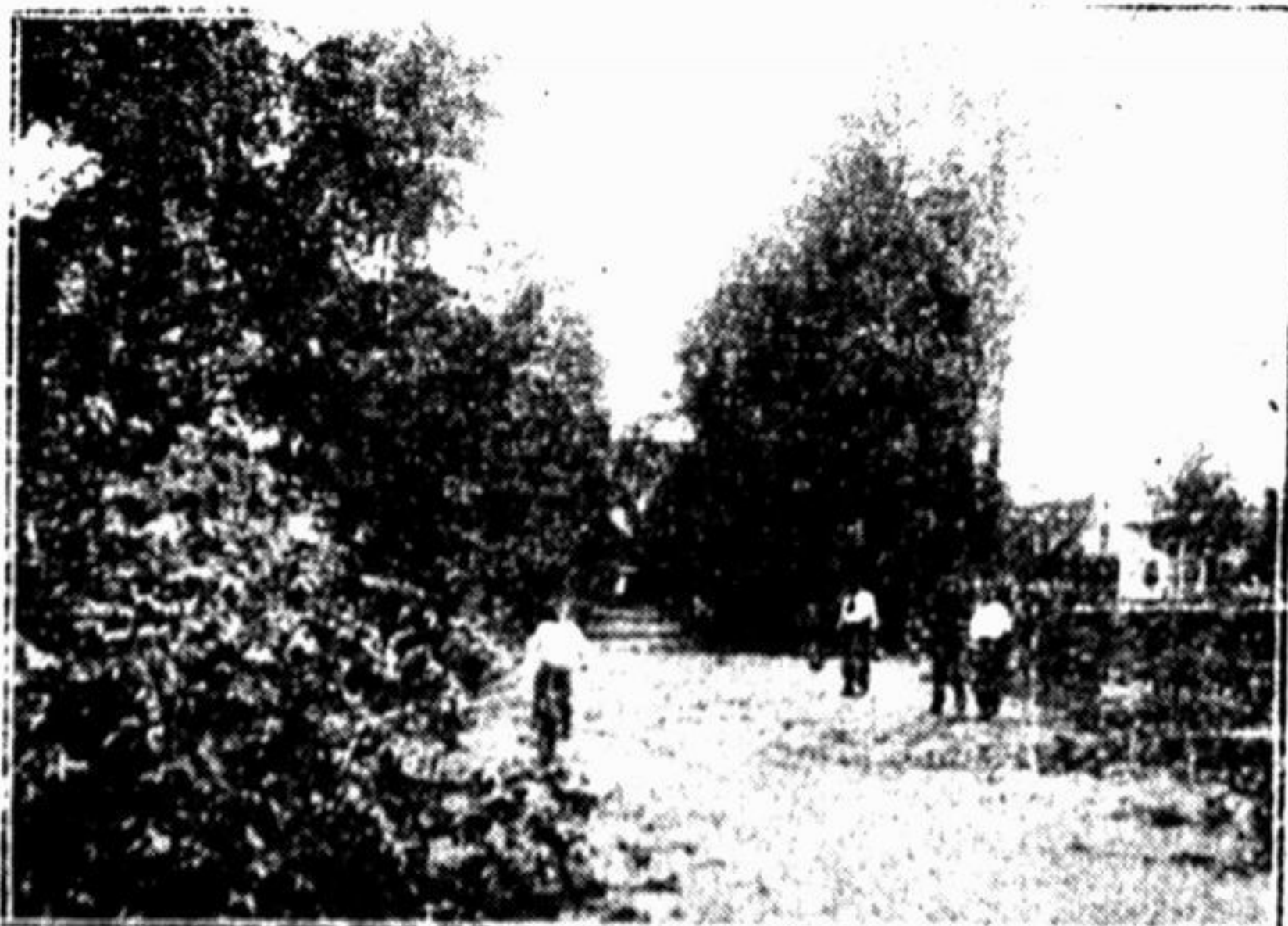
Looking north on Highland avenue from Prairie showing how the street looked after the worst had been cleared away. In the picture are Ed. Yackley and Village Commissioner Wm. Bender and son. The Bender yard was a mess of fallen trees and branches.