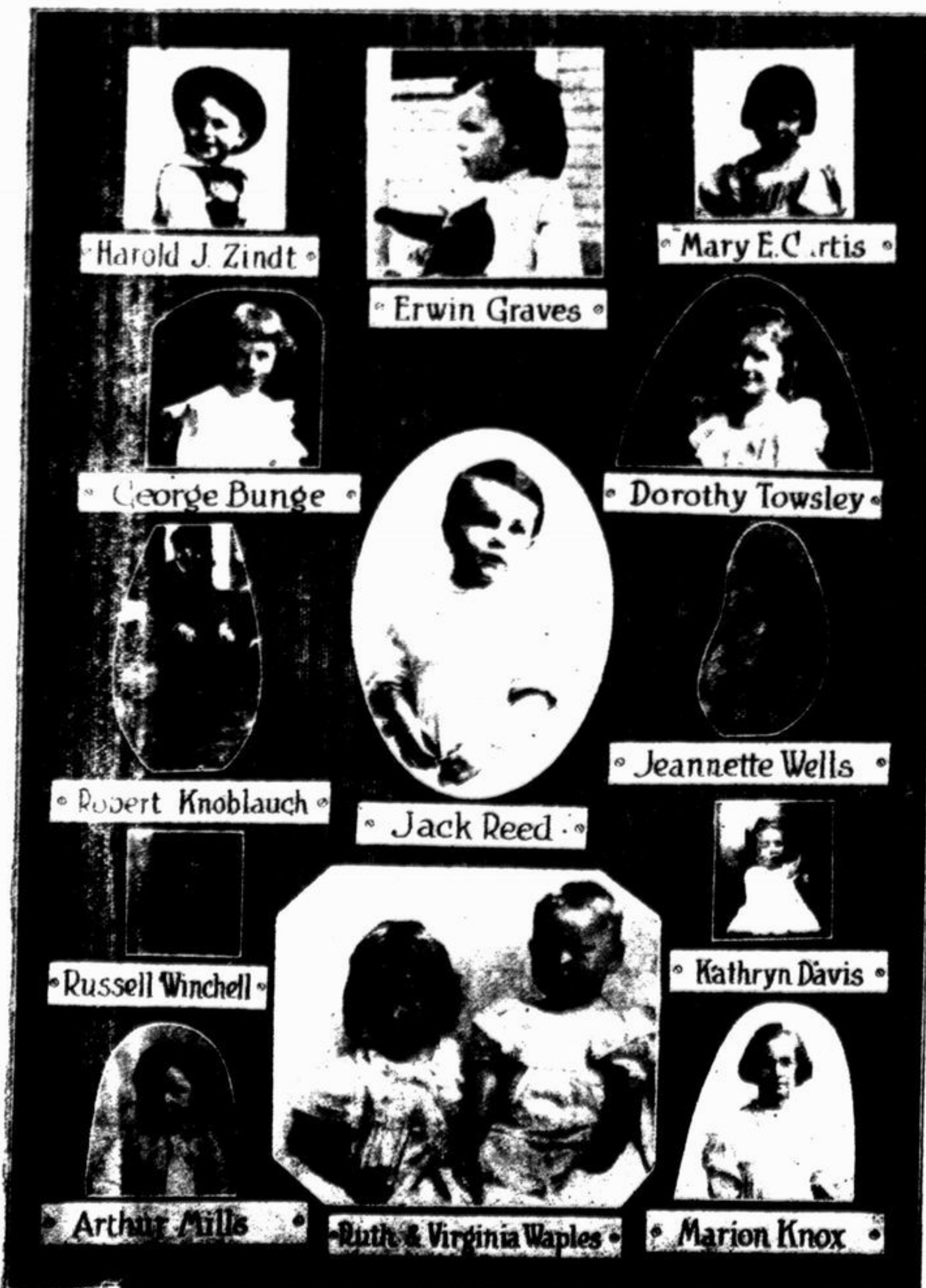
Yes — They Grew Up to be Seniors