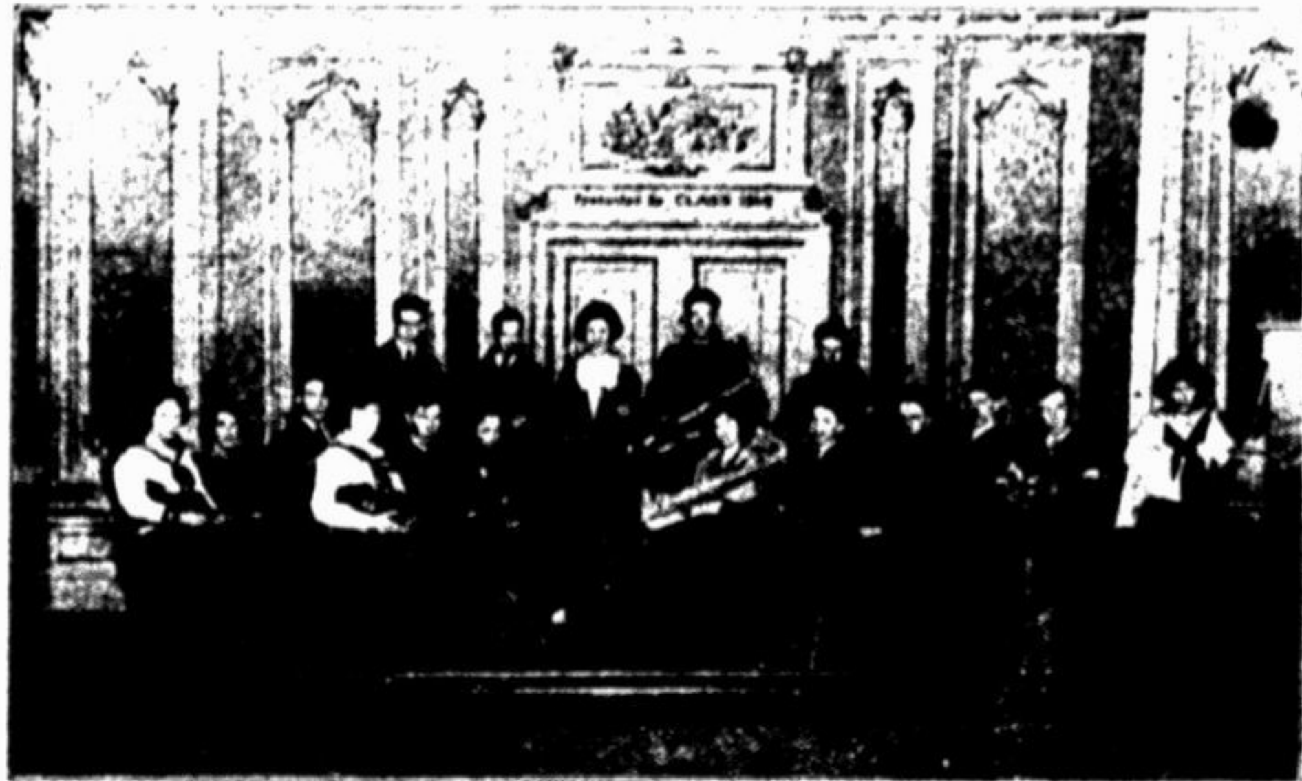
They Made Music to Tickle Your Ears.