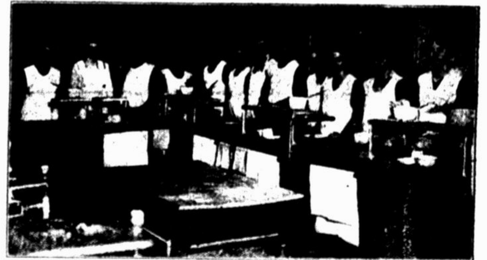
They Made Viands to Tickle Your Palate.