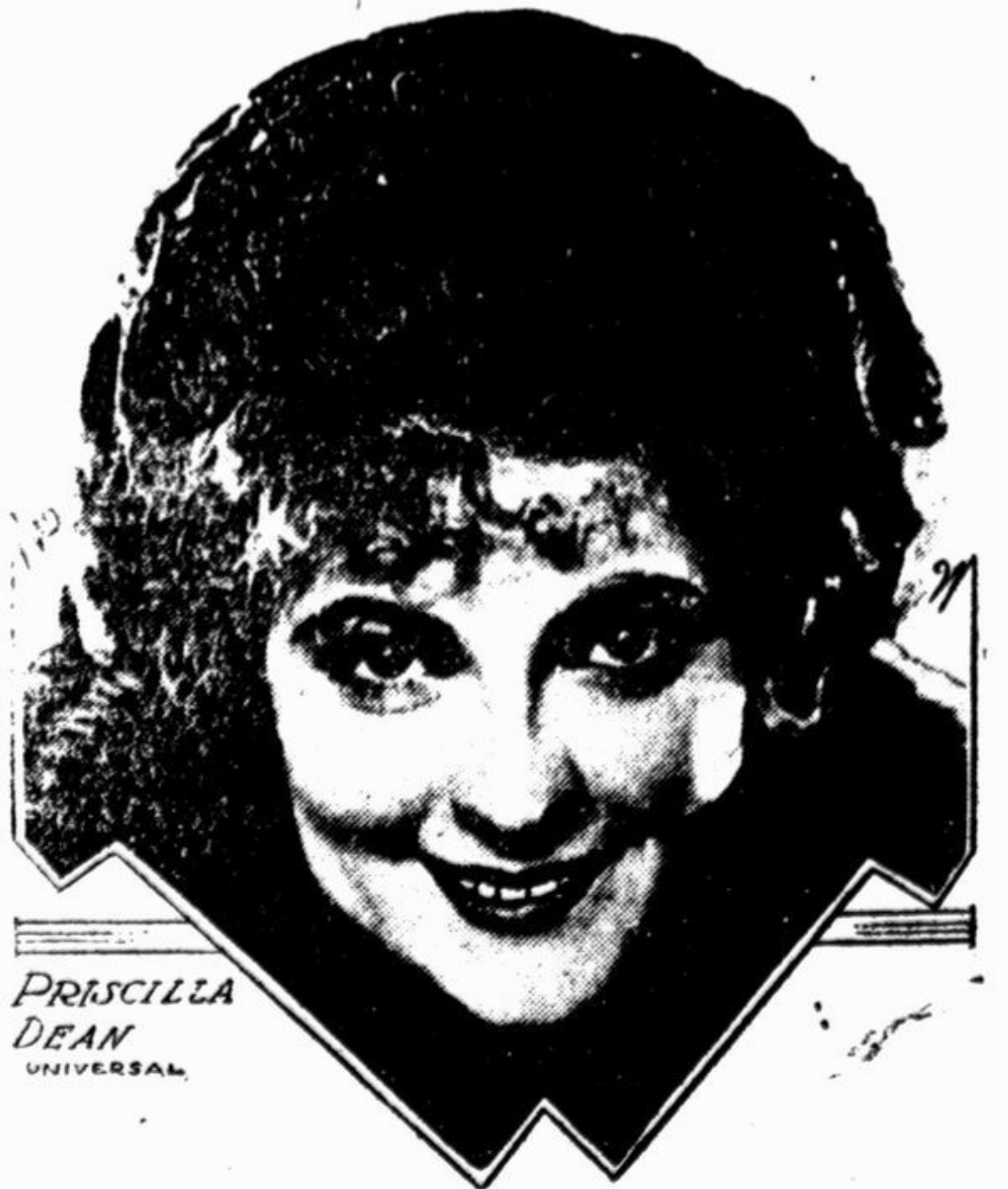
PRISCILLA DEAN UNIVERSAL