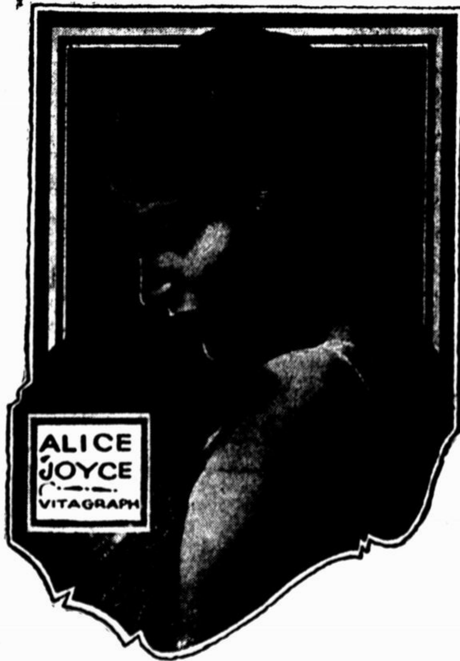
ALICE JOYCE VITAGRAPH