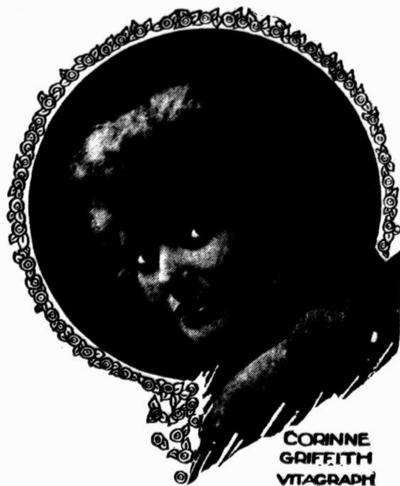
CORINNE GRIFFITH VITAGRAPH