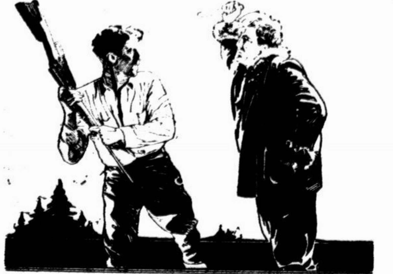
JAMES OLIVER CURWOOD'S "ISOBEL" OR 7/8 THE TRAILS' END AN ALLURING LOVE STORY OF THE GREAT NORTHWEST WITH HOUSE PETERS and JANE NOVAK AN EDWIN CAREW PRODUCTION

The greatest Curwood story of them all! An epic of the Northland! A romance that will be enjoyed by every man, woman and child who sees it.