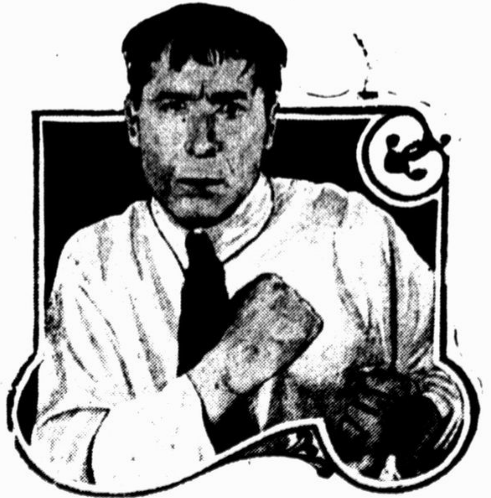
WILLIAM S. HART in a scene from "THE CRADLE OF COURAGE" A PARAMOUNT PICTURE