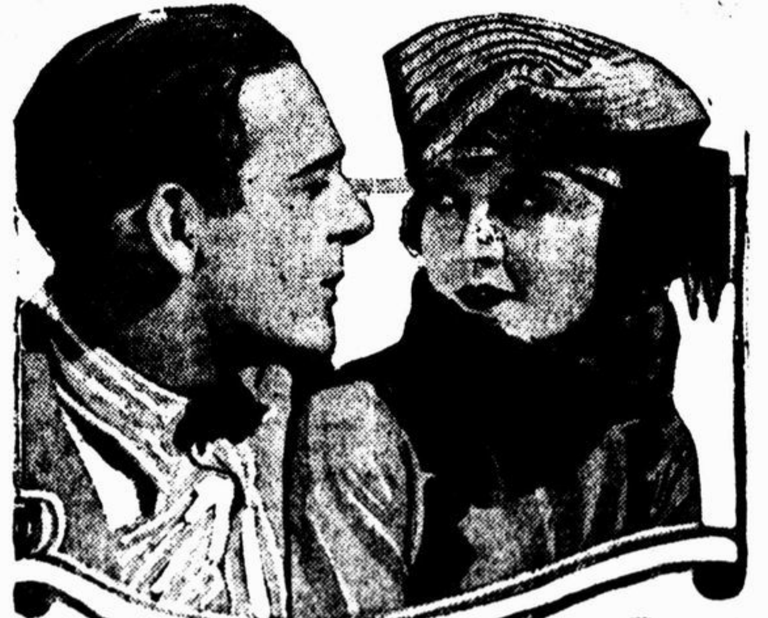
WALLACE REID and LOIS WILSON in a scene from "WHAT'S YOUR HURRY?" A PARAMOUNT PICTURE