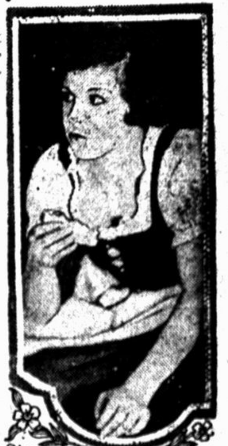
Miss SHIRLEY MASON DIRECTION WILLIAM FOX