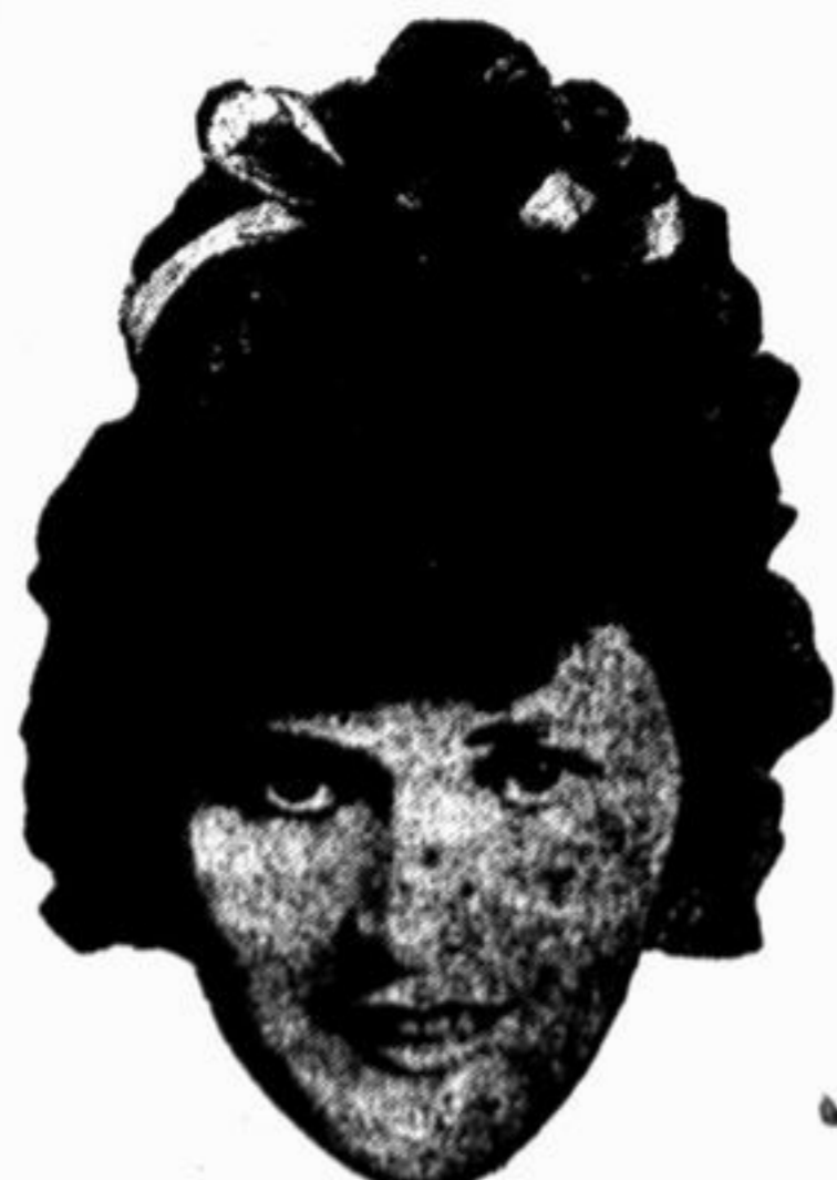
This is RUTH ROLAND