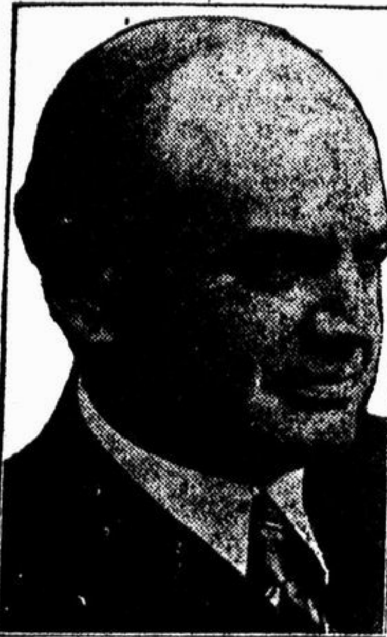
LIEUT.-GOV. JOHN G. OGLESBY, Republican Candidate for Governor of Illinois.

ILLINOIS IS—Discounting its Bills—Has $16,000,000 surplus in its treasury! $60,000,000 in hard road bonds, and $20,000,000 in waterway bonds!