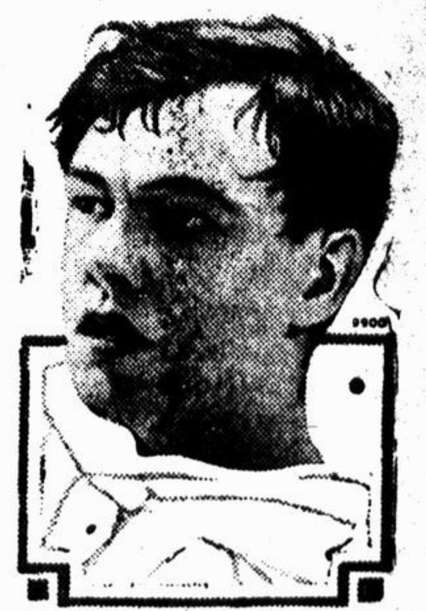
CHARLES RAY in the THOMAS H INCE production "PARIS GREEN" A PARAMOUNT ARTCRAFT PICTURE

His uniform laid away and the war and France but a memory. Till a dainty bit of Paris came to Quigley Corners, looking for Corporal Luther Green! Then things began to happen! A Rural Story of Real Folks