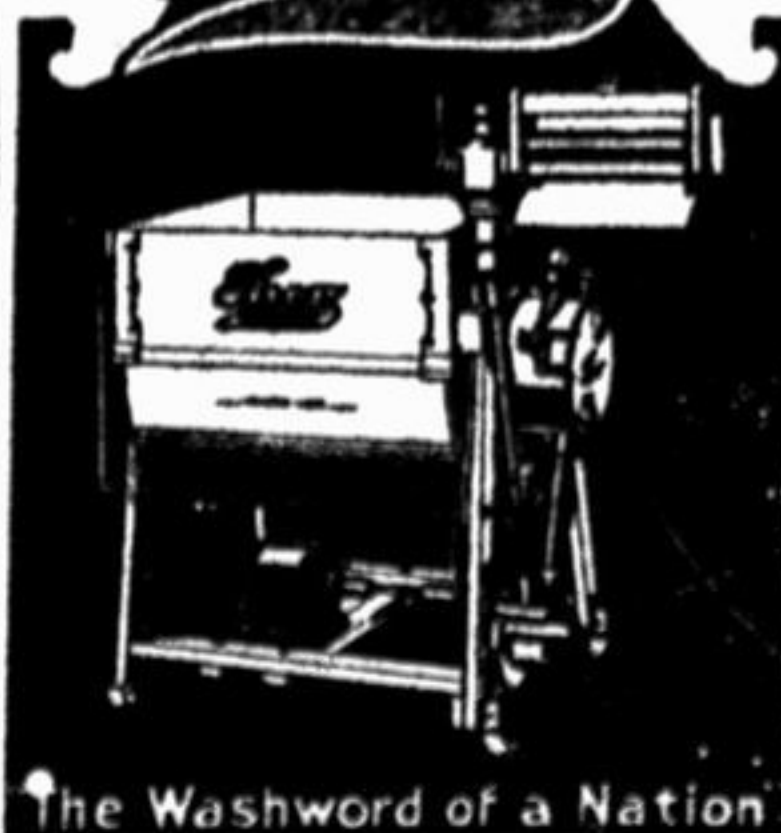
The Washword of a Nation

There is no washing machine, hand or electrically operated, which is so universally used in Downers Grove.