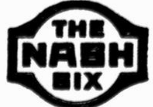
Perfected Valve-in-Head Motor

The Nash Six with its Perfected Valve-in-Head Motor has built a most enviable reputation for making permanent owners because its unusual power, quietness, economy and dependable performance insure the highest satisfaction to the experienced driver.