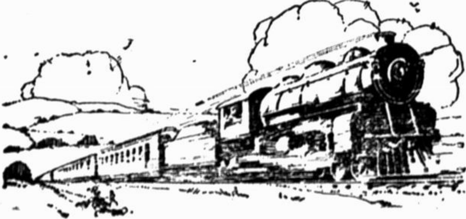
A vast amount of work now remains to be done which the intensification of war has more nearly delayed and accelerated, and the results in that a few very large coastal expenditures ought to be made to make up for the interruptions inevitably due to the war, and to prepare the railroads to serve adequately the increased traffic throughout the country. WALKER D. HINES, Director General of Railroads.

Thanking All My Customers For Their Patronage During the Past Year I Wish Them Each and Every One A Happy 1920 MORRIS SHOE STORE 64 South Main Street. Downers Grove, Ill.