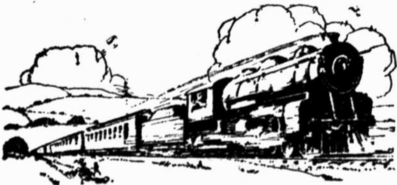
The railways of the United States are more than one-third, nearly one-half, of all the railways of the world. They carry a yearly traffic on such a scale as has no parallel in any other country that there is really no basis for comparison. Indeed, the traffic of any ten nations may be combined, and still it does not approach the commerce of America borne upon American railways.

64 South Main Street. Downers Grove, Ill.