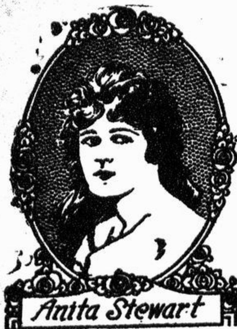
All of These Distinguished Actors in One Drama

Together they form the greatest All-Star Cast in the history of the screen.