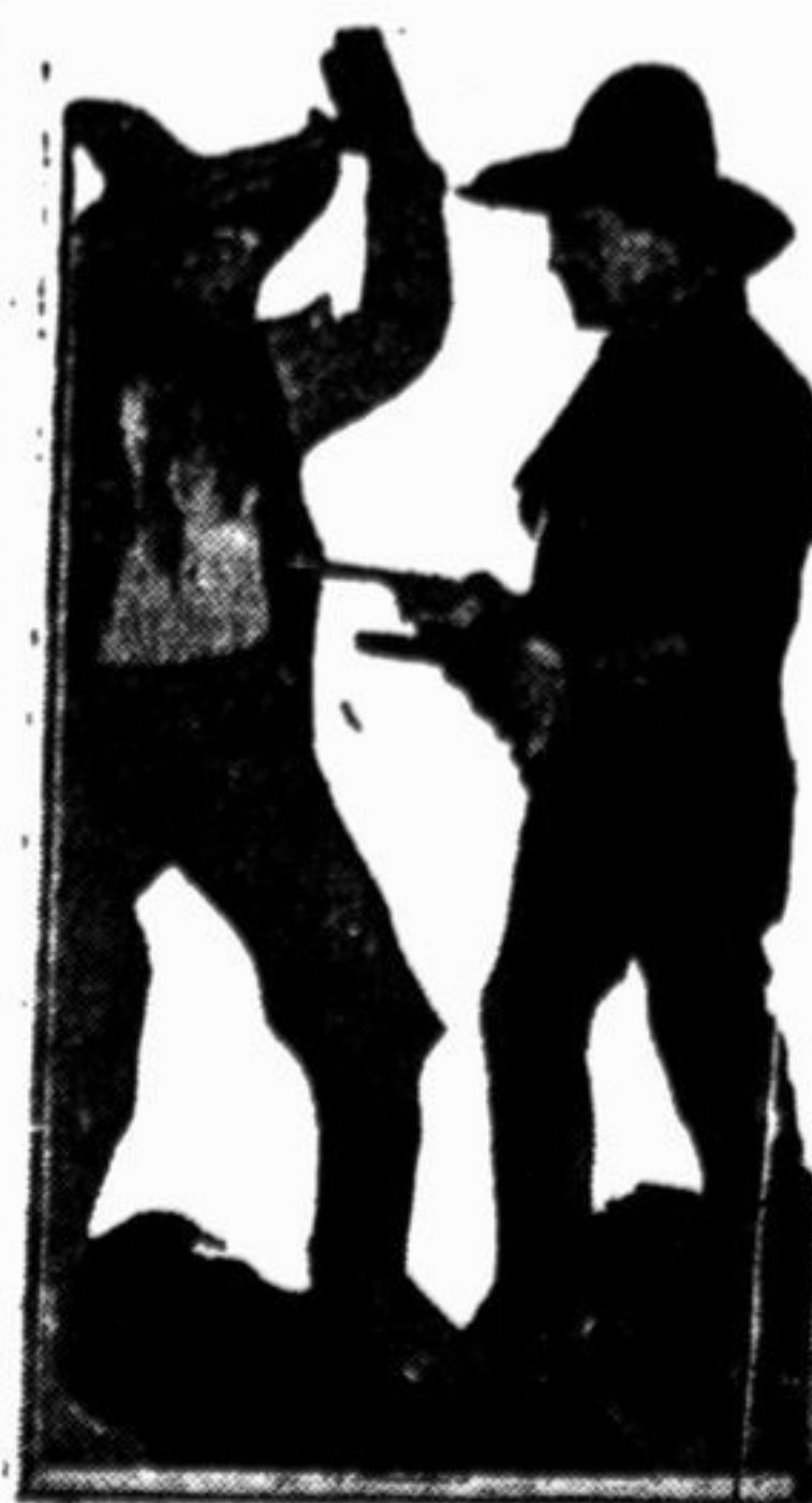
"THE LONE STAR RANGER" WILLIAM FOR PRODUCTION