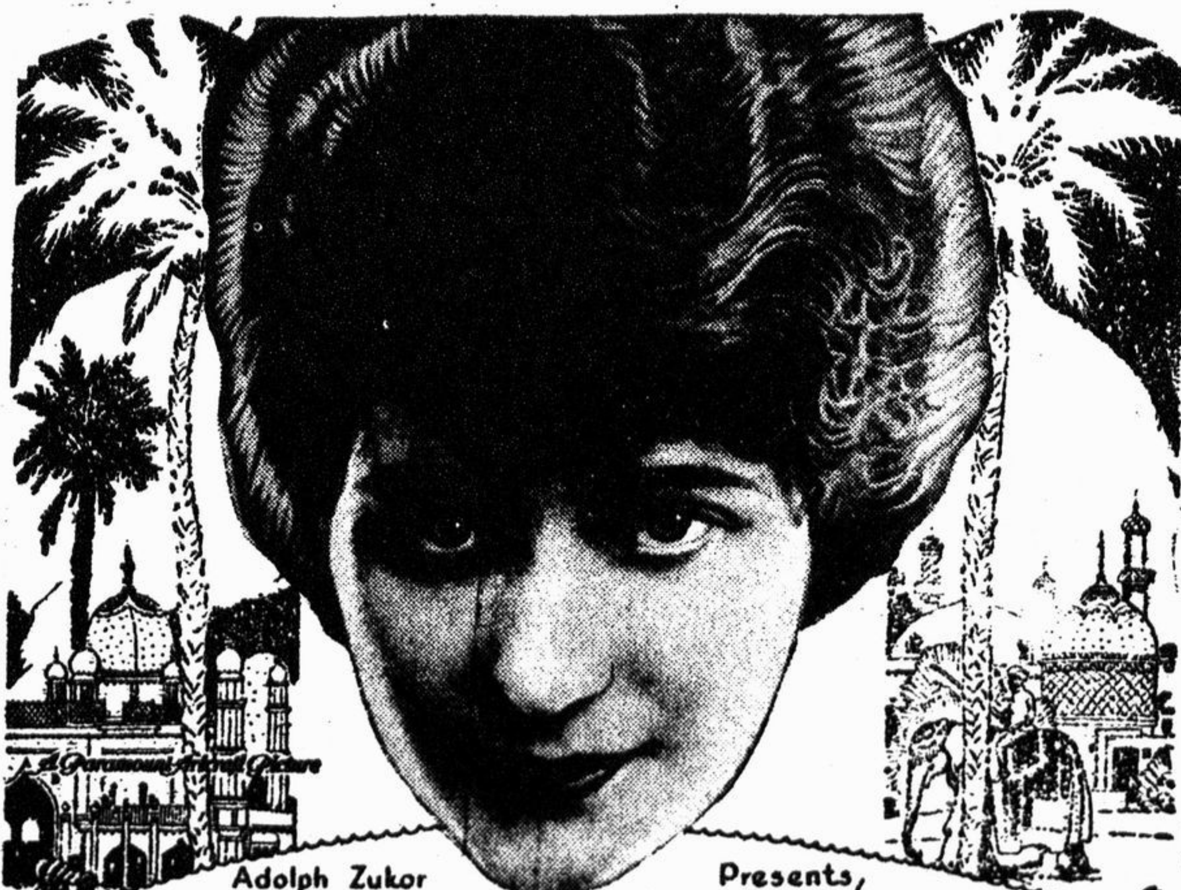
Adolph Zukor Presents,

ELSIE FERGUSON "THE WITNESS FOR THE DEFENSE" Directed by GEORGE FITZMAURICE.