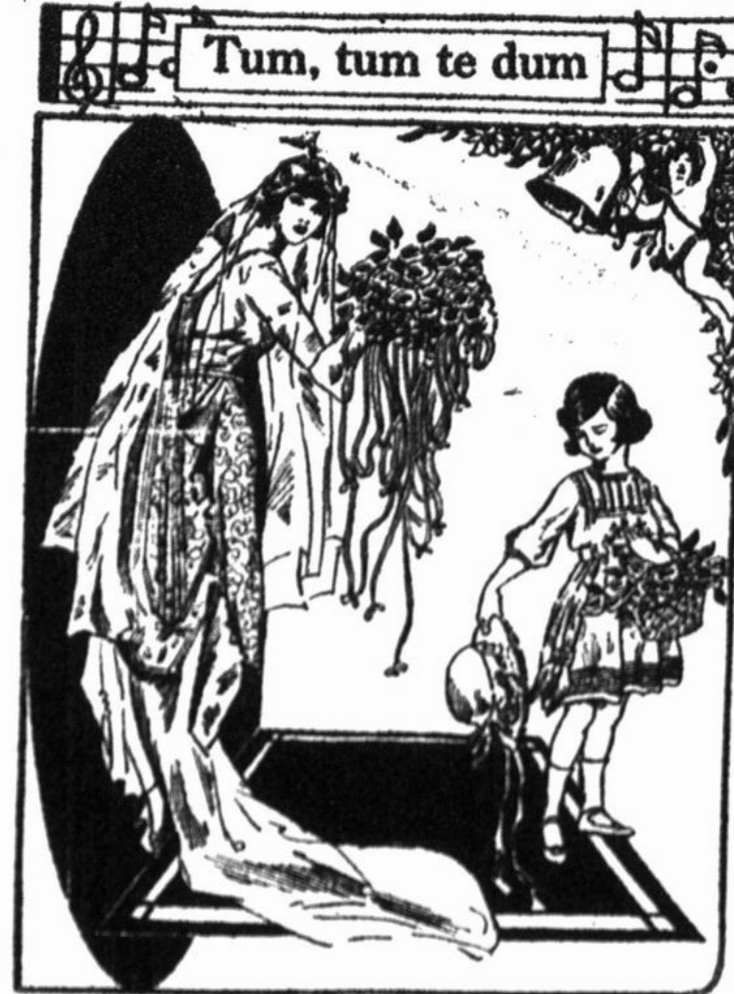
One swallow does not make a spring—neither is a spring complete without its June bride—therefore, behold, the 1919 bride in all her peacetime splendor. The military marriage is quite past (save now and all the frills of prosperity years are in order. Here in ivory satin, the bodice and skirt covered with shadow lace and with tulle used in the upper part of the train, this maid is happy. The little flower girl in handmade frock with real lace insertion and hand embroidery at the belt, is tucked about with a blue satin sash.

Senator Thomas Sterling of South Dakota is gunning for bolsheviks. He will father a bill in the next congress asking that unloyal aliens be deported without trial if caught participating in revolutionary riots to prohibit the red flag, and censorship of literature which preaches disloyalty.