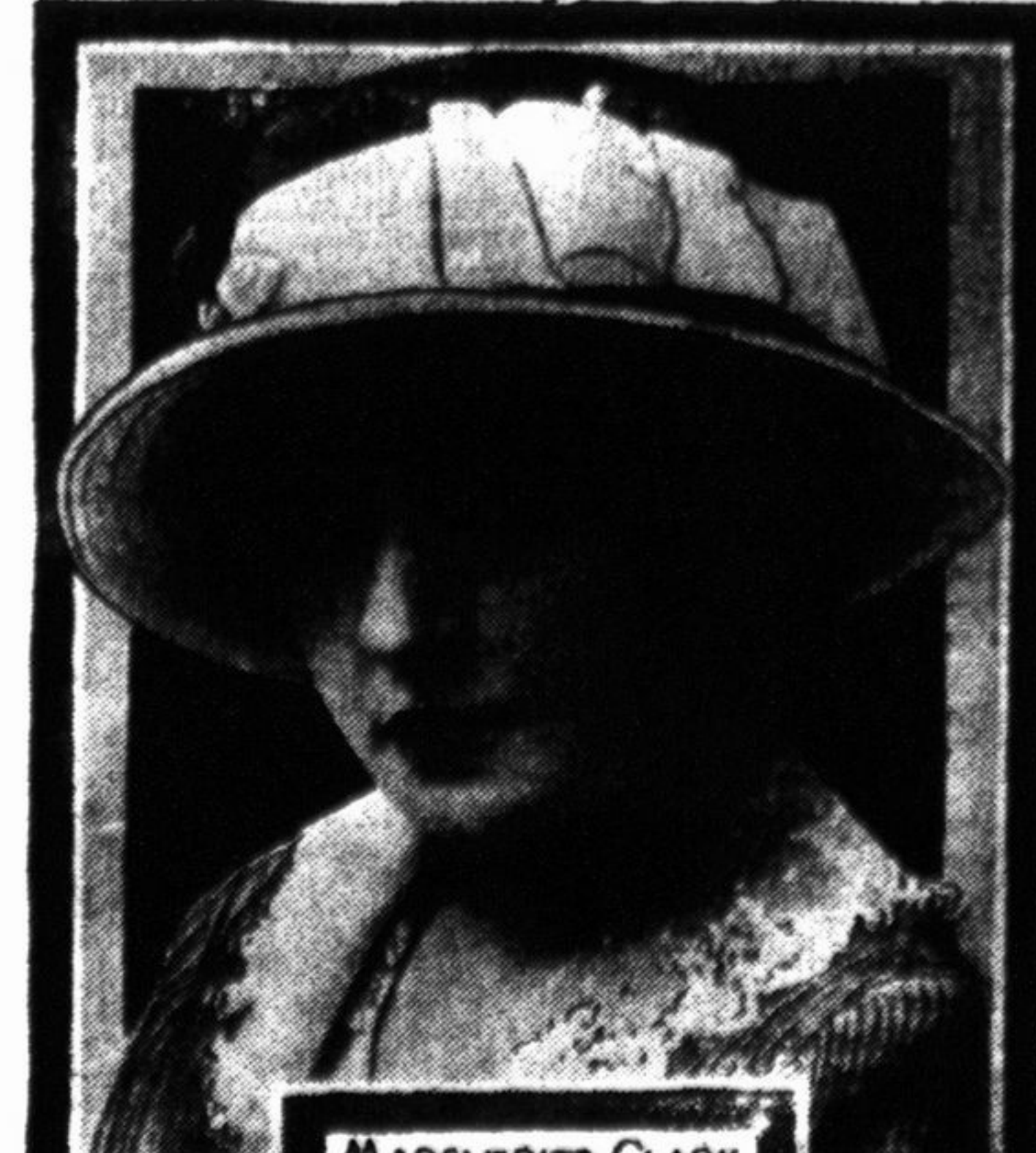
MARGUERITE CLARK in Paramount Pictures

Soldiers and Sailors in uniform admitted free to any performance at this theatre. We wish to do our bit to show our boys a good time while visiting in Downers Grove.