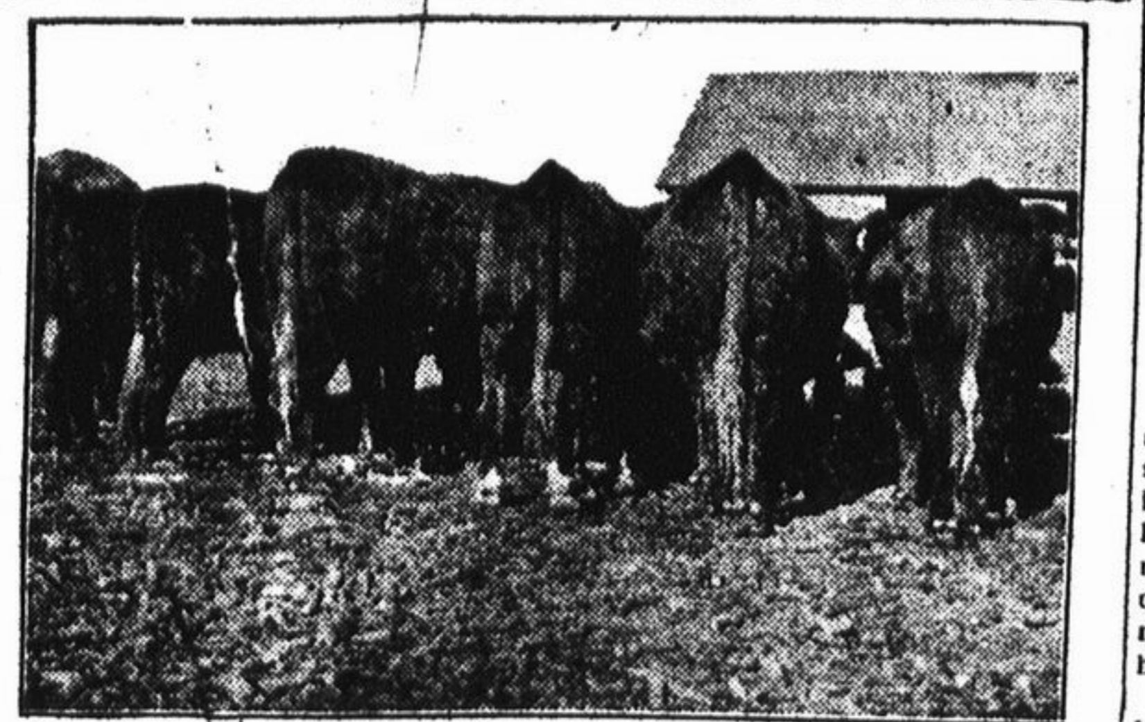
The Owner of These Calves Has Learned the Art of Making Baby Beef.