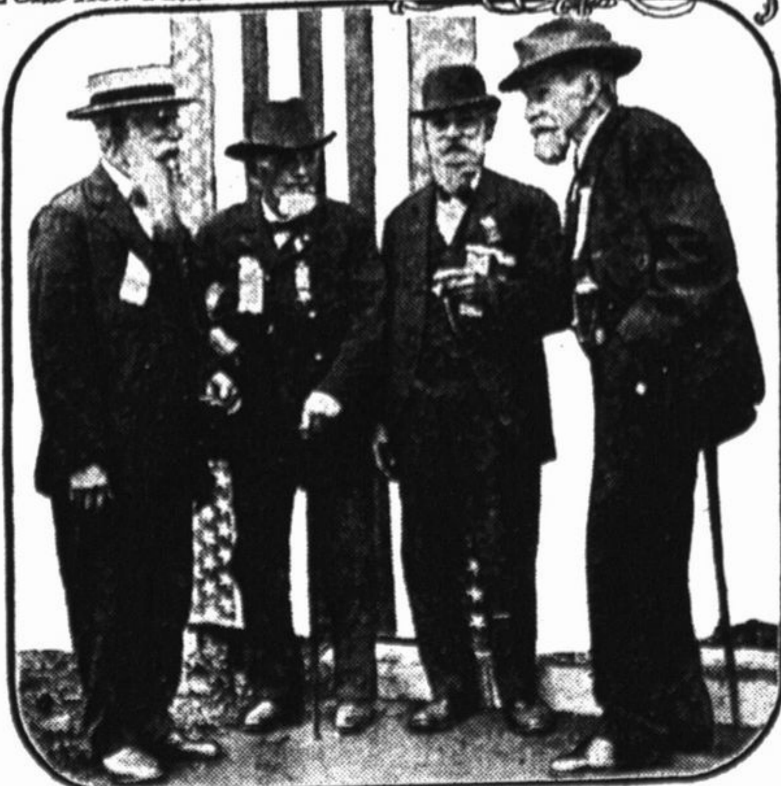
RECALLING INCIDENTS OF THE WAR

M EMORIAL day, as it is now observed in most of the states of the Union, is a day of thankfulness, patriotic thankfulness for the preservation of the Union. A majority of people who will take part in the strewing of flowers on soldiers' graves are not veterans who fought in the Civil war. To those who are old enough to remember the war, its memories have softened and grown calm, its material evidences have about all faded from sight. To those who are not old enough to remember the war, its events are only matters of history. But to the old soldier Memorial day is a day of reflection and meditation. He will be thinking of events of those "stirring times" as living realities. Some thirtieth of May in the Civil war, in all probability, was to him an eventful day. Possibly he may remember some event that took place on each thirtieth of May in the war. Go back with him in his reflection as he fancies himself back in those old days, and begin with the first thirtieth of May in the Civil war. It was 54 years ago.