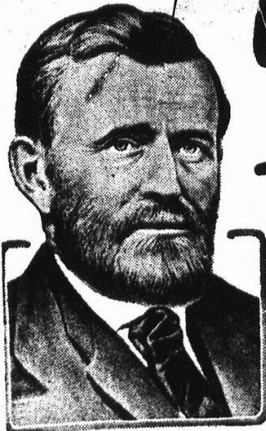
GEN. U.S. GRANT