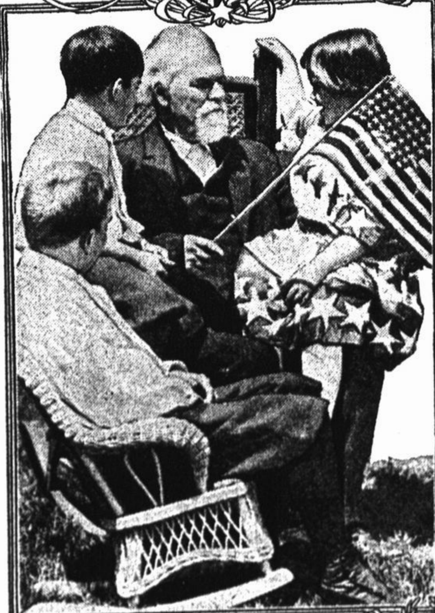
"TOLD HOW FIELDS WERE WON"