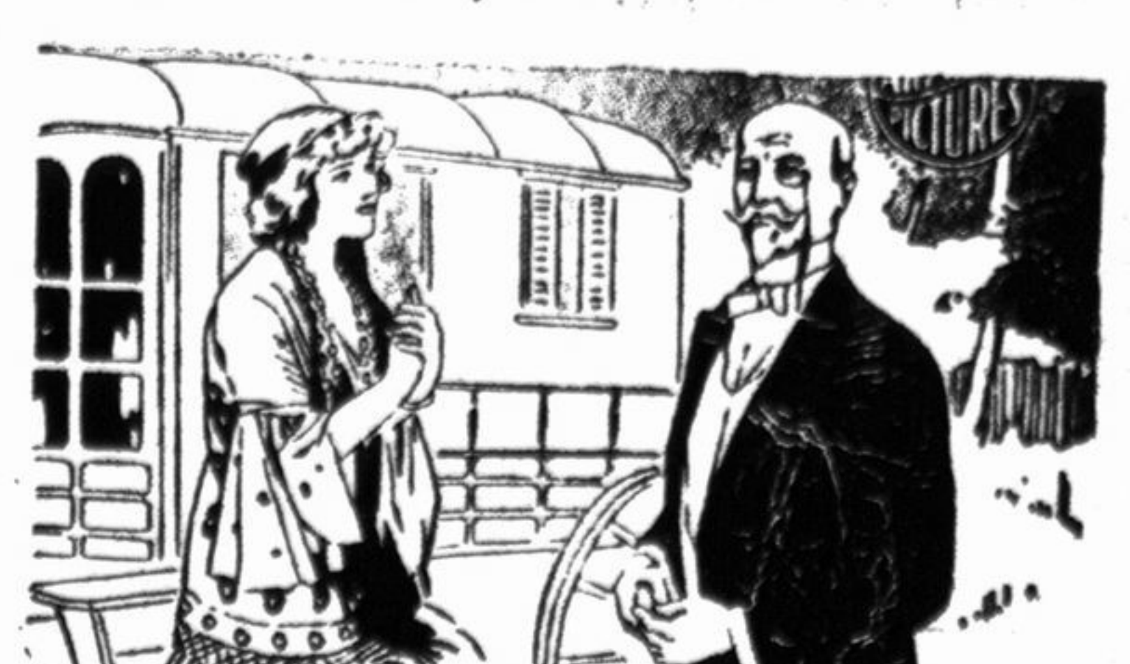
Beauty and the beast!