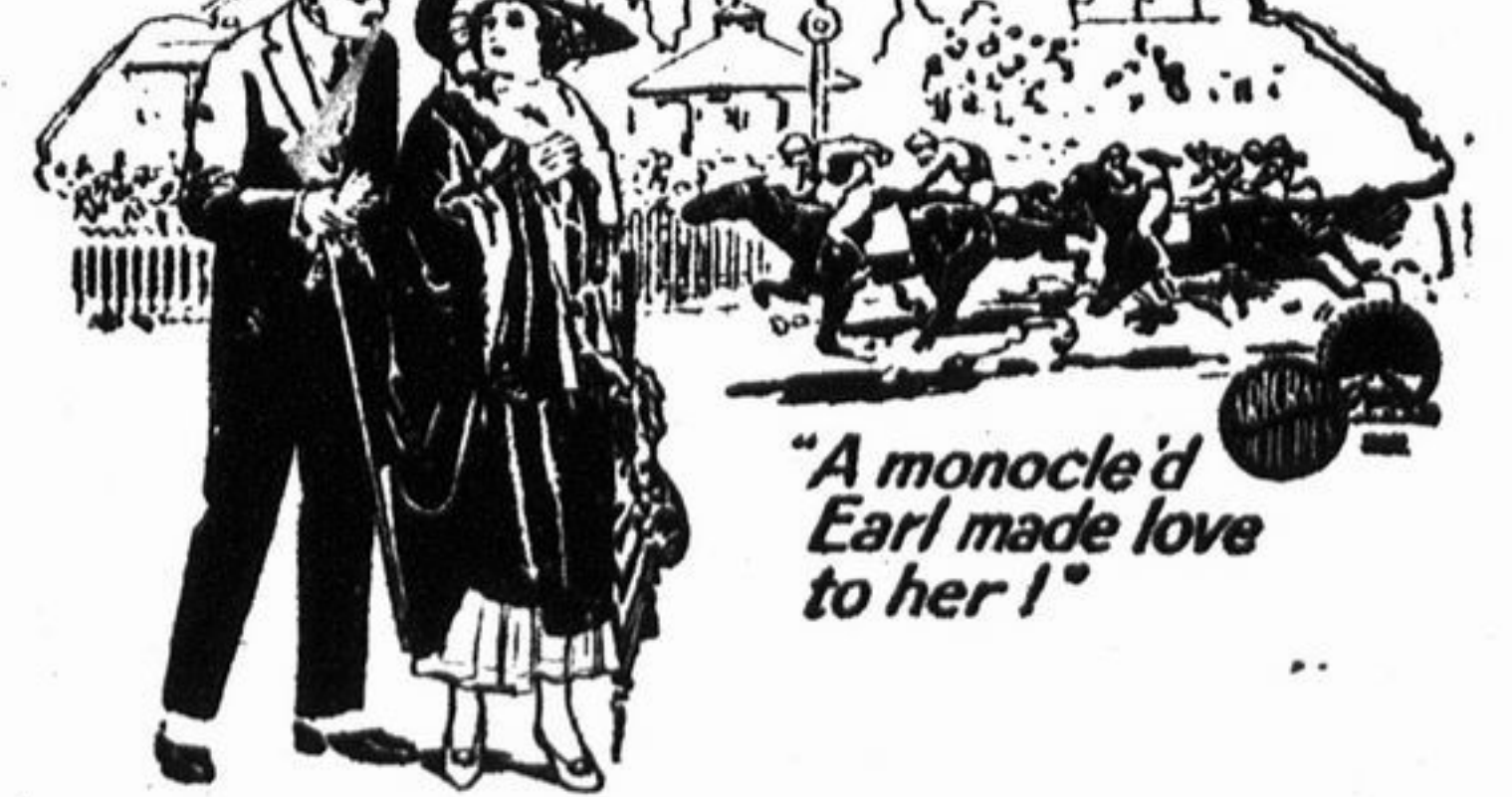
"A monocle'd Earl made love to her!"