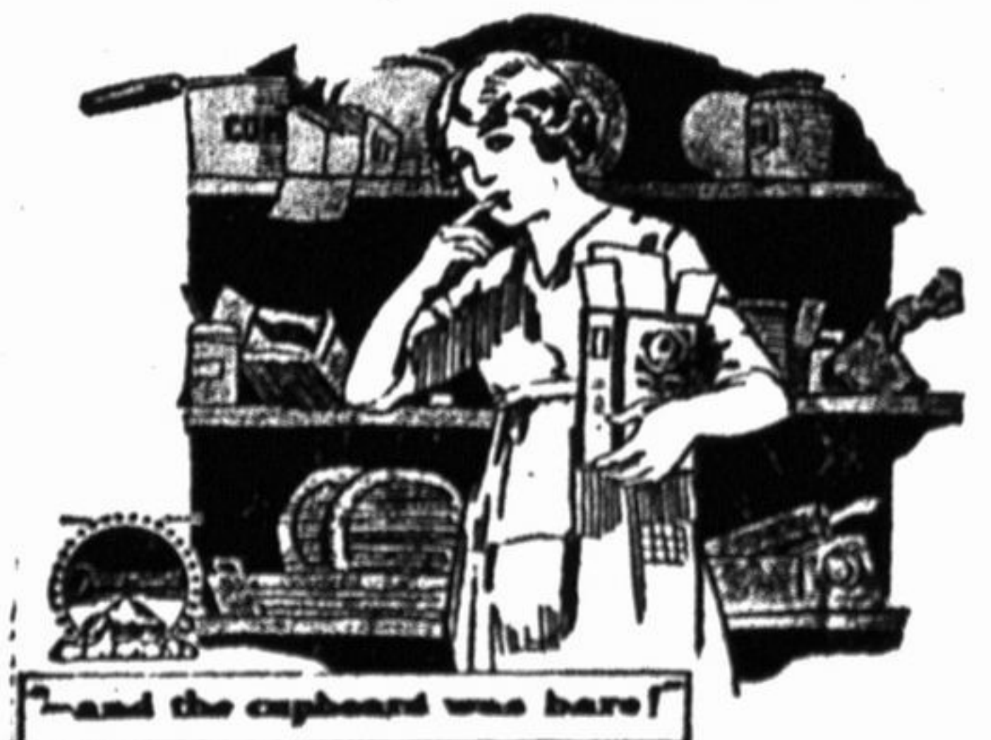
"and the cupboard was bare!"