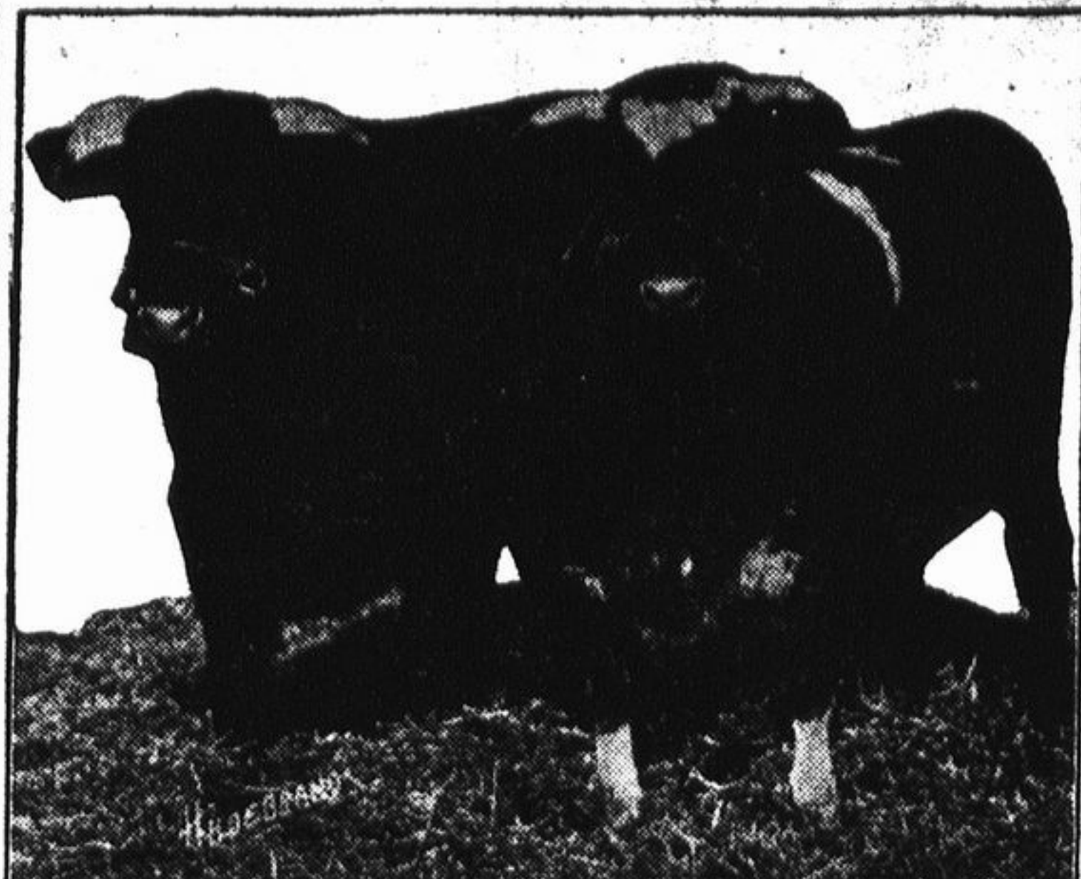
CHAMPION PAIR OF KANSAS BRED SHORTHORN STEERS.

Silage is just as indispensable to successful beef-cattle raising as it is to successful dairying. In fact, during these times of high-priced feedstuffs it is highly essential. As with sheep and horses, silage alone is too wide a ration. Cattle receiving silage exclusively will not do well. Cottonseed meal, linseed oil meal, clover alfalfa or pea hay should be fed with it. Pasturing steers will eat 20 to 25 pounds per head daily. Wintering yearlings will do likewise. Calves may be fed all the silage they will clean up twice a day. Grain and legume hay should, in all cases, be fed in addition. Bulls also thrive on silage. From 10 to 15 pounds per head daily plus hay and some grain are sufficient to keep them in good condition. Pregnant beef cows will eat 30 to 40 pounds of silage per head daily plus some hay.