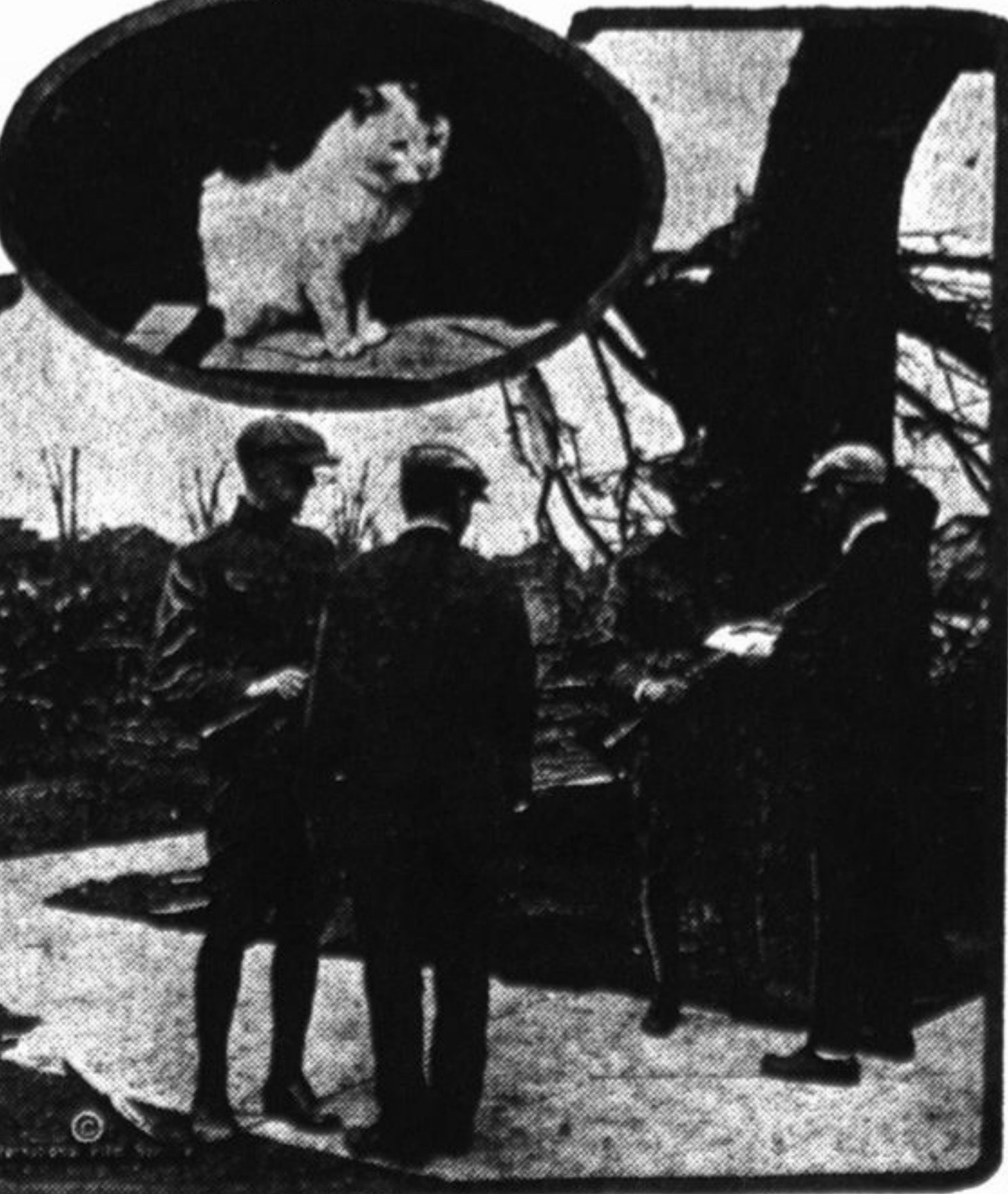
To prevent looting and other crimes in the Illinois towns struck by the tornadoes, members of the National Guard were put on duty. One of them is shown here questioning a stranger. Above is a family cat that "came back" to the ruins of the only home it knew.