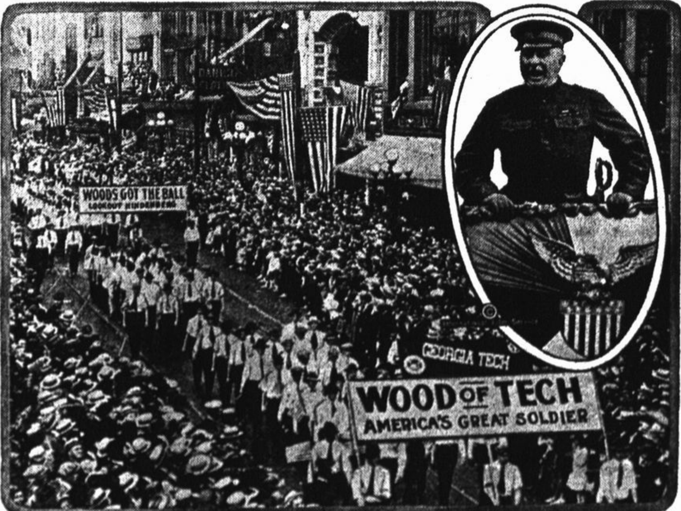
Maj. Gen. Leonard Wood, arriving in Atlanta to take command of the department of the Southeast, was accorded a rousing welcome. The illustration shows the parade of the students of the Georgia School of Technology, which General Wood once attended, and, inserted, the general addressing the great crowd at the flag-raising in his honor.