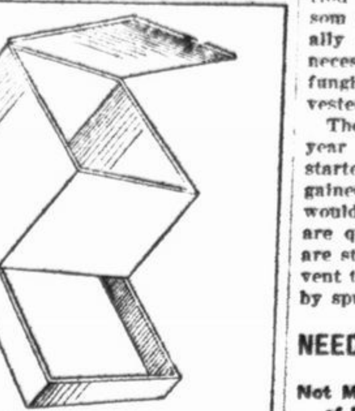
Feedbox for Bolters.

If your horse has the habit of bolting his feed you can easily remedy it by making a self-feeder for him. The