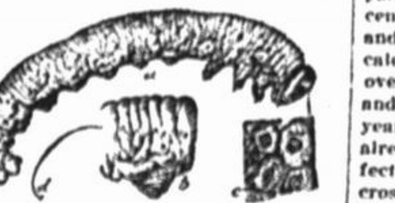
Dock False-Worm—(a) Full-Grown Larva; (b) Larva Segment; (c) Portion of Cranium; (d) Actual Length.

The dock false-worm is the larva of a sawfly found all over Europe and in Canada and the northern part of the United States, from the Atlantic to the Pacific. The larva is a green, wormlike creature, which feeds on dock and related plants; frequently, however, where conditions are favorable, it finds its way at maturity into apple trees, where it bores into the apples to hibernate, making them unsalable. The dock false-worm has four generations annually, each generation oc-